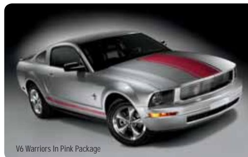
V6 Warriors In Pink Package