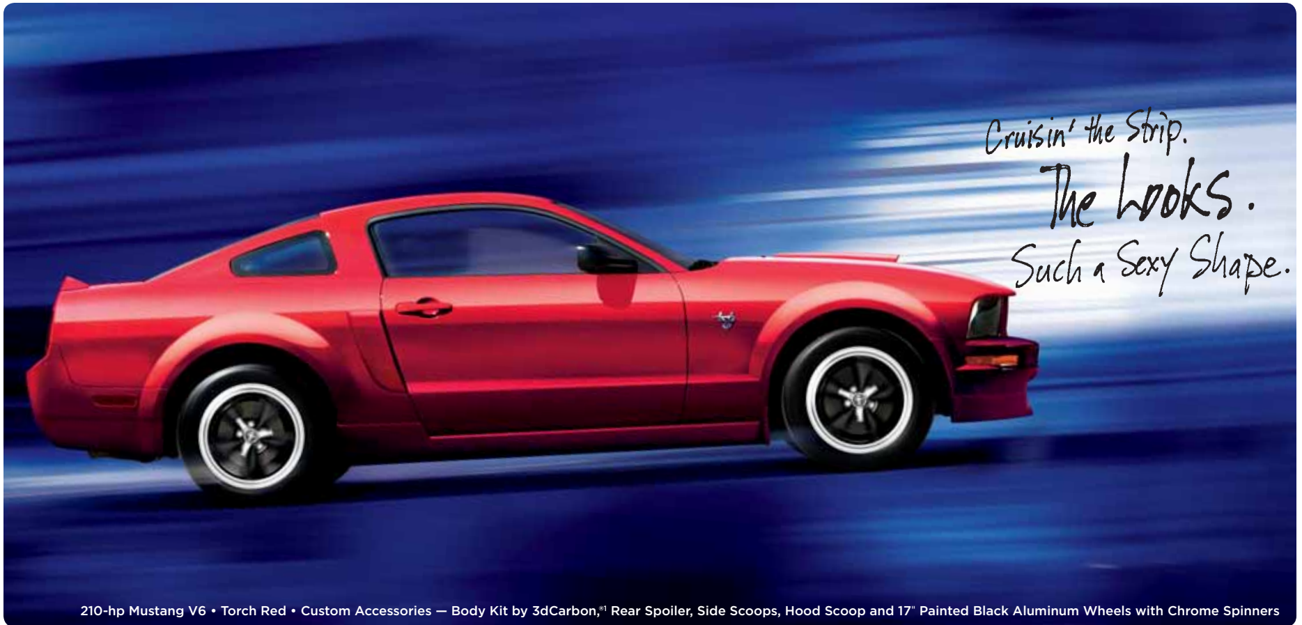
210-hp Mustang V6 • Torch Red • Custom Accessories — Body Kit by 3dCarbon, † Rear Spoiler, Side Scoops, Hood Scoop and 17" Painted Black Aluminum Wheels with Chrome Spinners