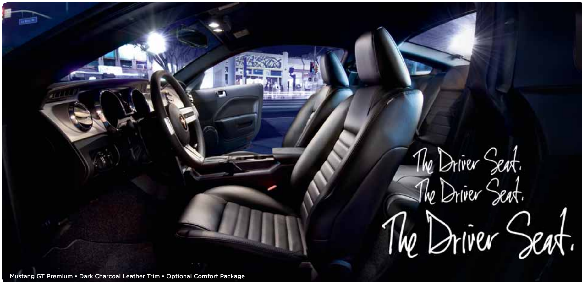
Mustang GT Premium • Dark Charcoal Leather Trim • Optional Comfort Package