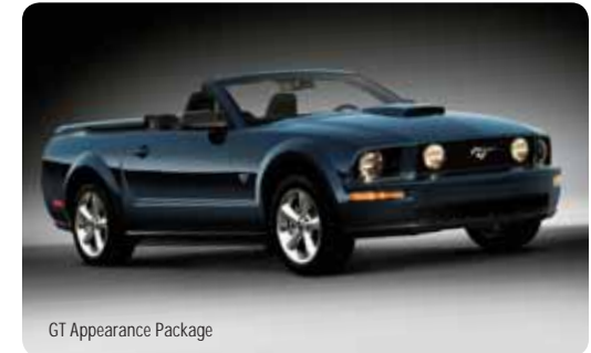
GT Appearance Package