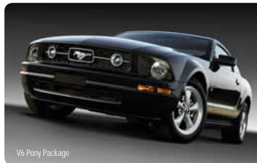
V6 Pony Package