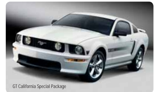
GT California Special Package