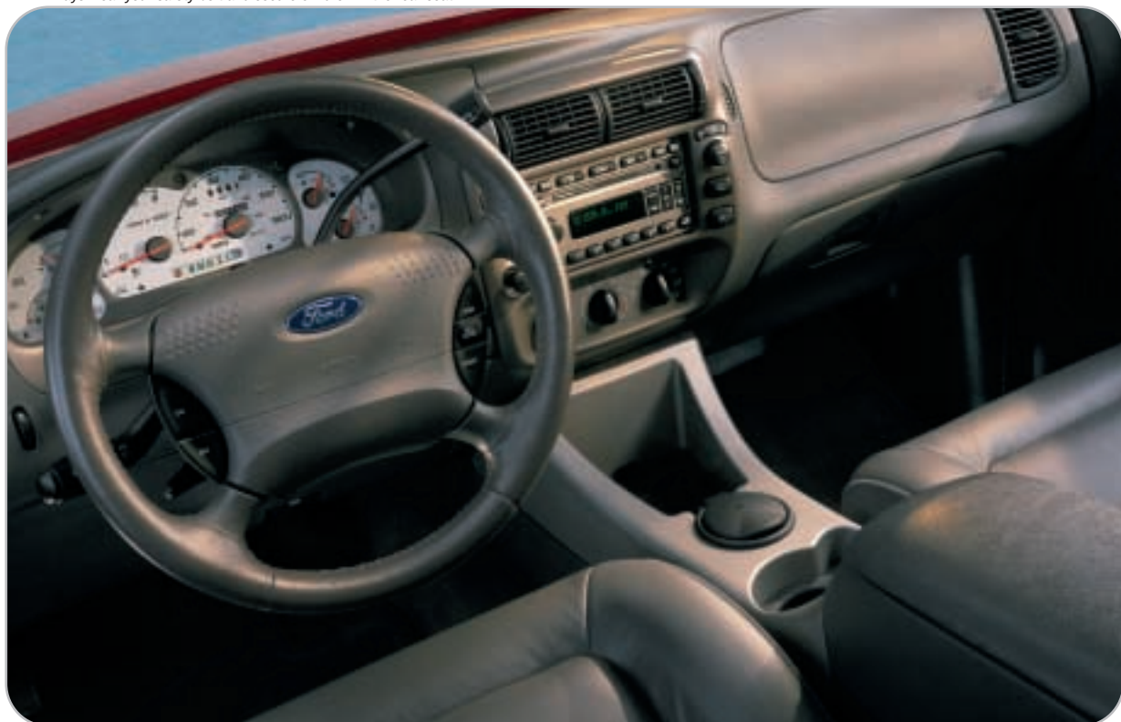
EXPLORER SPORT PREMIUM 4x4 INSTRUMENT PANEL WITH OPTIONAL DARK GRAPHITE LEATHER SEATING SURFACES AND PIONEER™ SOUND SYSTEM WITH IN-DASH 6-DISC CD CHANGER.

<sup>\dagger</sup> Always wear your safety belt and secure children in the rear seat.