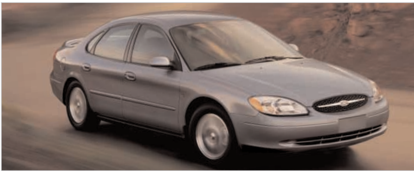
Taurus SEL Premium shown in Dark Shadow Grey and with optional equipment.

HE JUST HAPPENS TO NOW HAVE FOUR DOORS AND DISC BRAKES.