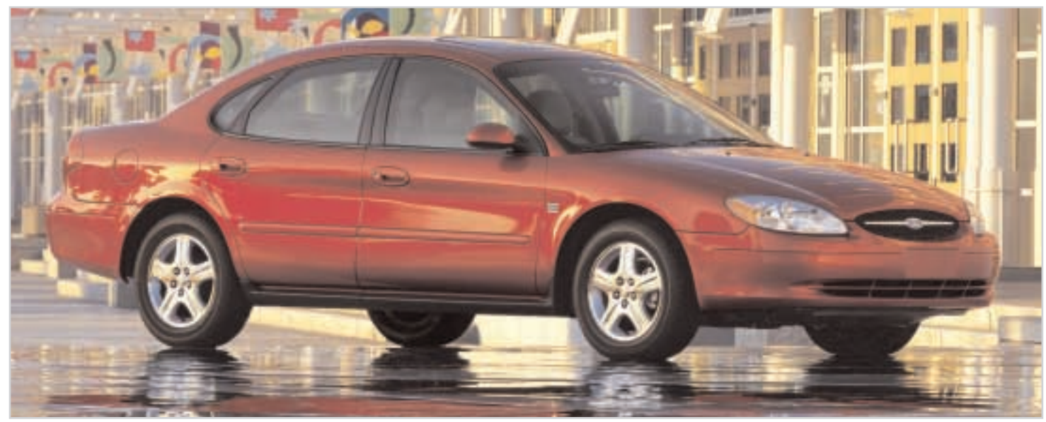
Taurus SEL Deluxe shown in Matador Red and with optional equipment.

It's no secret why so many people develop such an immediate connection with Taurus. Even for those who've just met, there's a feeling of trust that comes from its quick response and its generous 200-horsepower engine (optional). You just know it's going to be there for you when life throws you a hairpin curve.