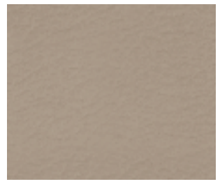
ium Cloth Medium/Dark Flint Premium Cloth Standard on XLT/XLT Sport