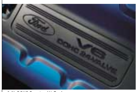
3.0L DOHC Duratec V6 Engine