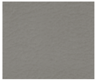
Medium/Dark Pebble Leather Medium/Dark Flint Leather Standard on XLT with Appearance Package, available on XLT Sport/Popular 2