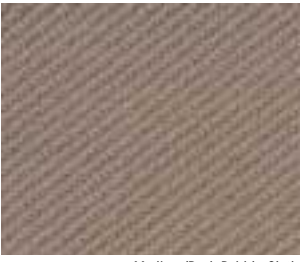
Medium/Dark Pebble Cloth