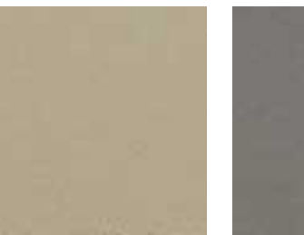
Medium Parchment Leather Optional on ZX5 Premium, ZTS and ZTW