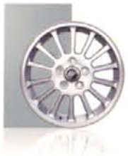
16-inch 14-spoke Platinum Edition

CENTER STACK SURROUND—satin aluminum FENDER BADGE—unique "Platinum Edition" aluminum badge FLOOR CONSOLE TRIM—satin aluminum LEATHER SEATING SURFACES—perforated front and rear (Medium Graphite only) SATIN ALUMINUM FINISH—on instrument panel, grille and decklid appliqué WHEEL AND CENTER CAP—14-spoke, satin aluminum