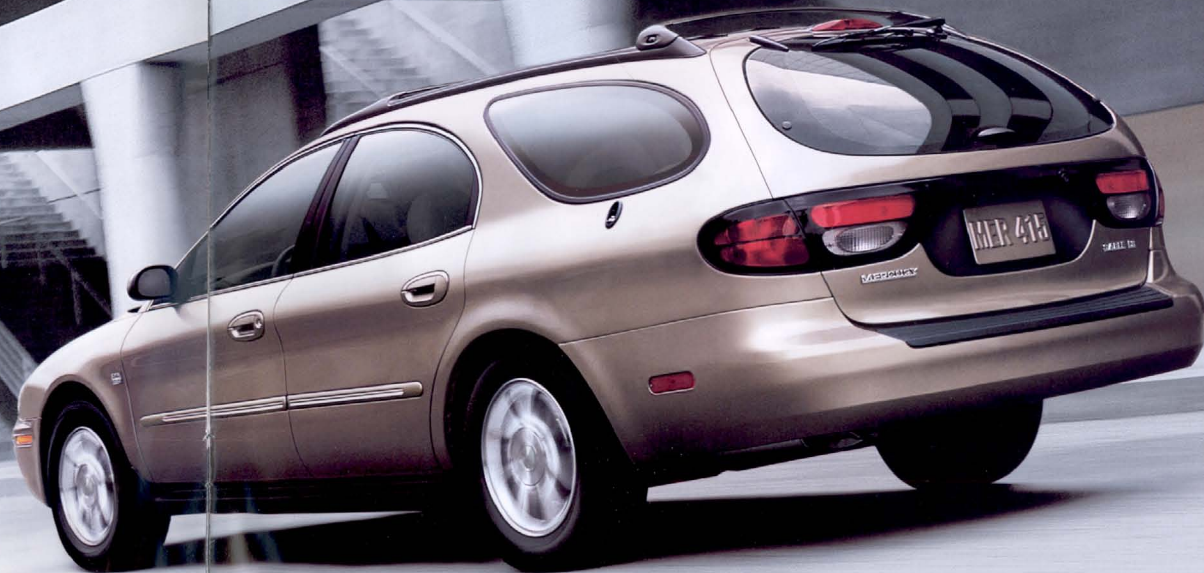
Mercury Sable LS Premium Wagon in Arizona Beige Clearcoat Metallic. Shown with available equipment.

You marvel at its thoughtful amenities. And you definitely feel it when you press the accelerator. On Sable GS and GS Plus, the 3.0-liter Vulcan V6 delivers torque-rich power to move you with quiet authority. On the Sable LS Premium, the 3.0-liter DOHC Duratec V6 responds with an impressive 200 horsepower. Either way, it's a commanding feeling.