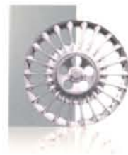
16-inch deluxe locking wheel cover

BRAKES—4-wheel Anti-lock Brake System (ABS)—no charge feature SEATS—5-passenger seating with dual recline, front armrest, front seatback map pockets, 2-way head restraints and floor shift/console SECURE PACKAGE—with driver and front passenger side-impact head/chest airbags 3 and All-Speed Traction Control WHEELS—7-spoke painted aluminum