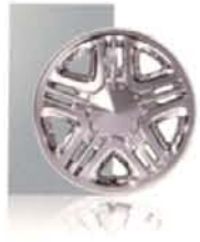
16-inch 5-spoke Chrometec wheel

BRAKES—4-wheel Anti-lock Brake System (ABS)—no charge feature MOONROOF—power with one-touch open feature and sunshade RADIO—MACH ® Audio System with AM/FM stereo/cassette/6-disc CD changer and 6 premium speakers SEAT—6-way power front passenger seat 4 SEATS—leather seating surfaces – no charge feature SEATS—6-passenger seating with dual recline, front armrest, front seatback map pockets, 2-way head restraints and front center seat/floor console SECURE PACKAGE—with driver and front passenger side-impact head/chest airbags 3 and All-Speed Traction Control WHEELS—5-spoke Chrometec