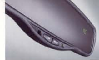
AUTO-DIMMING REARVIEW MIRROR

An available large rearview mirror automatically dims glaring headlight reflections, and a built-in compass indicates the direction in which you are traveling.