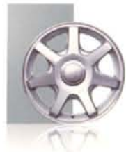
16-inch 7-spoke painted aluminum

BRAKES—4-wheel Anti-lock Brake System (ABS)—no charge feature SECURE PACKAGE—with driver and front passenger side-impact head/chest airbags 3 and All-Speed Traction Control WHEELS—7-spoke painted aluminum