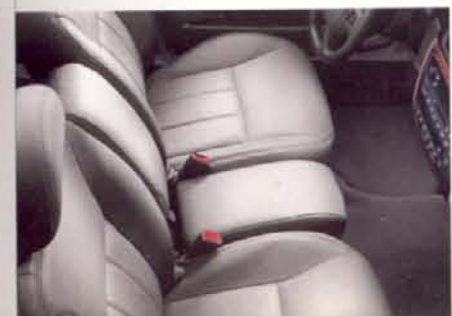
FLIP-FOLD CENTER CONSOLE

Sable offers plenty of useful storage within easy reach. With the 6-passenger sedan or the 8-passenger wagon, the available flip-fold center console feature opens to reveal dual cupholders, a tray for sunglasses and a bin for music accessories. And you've got a padded armrest to enhance your comfort while driving.