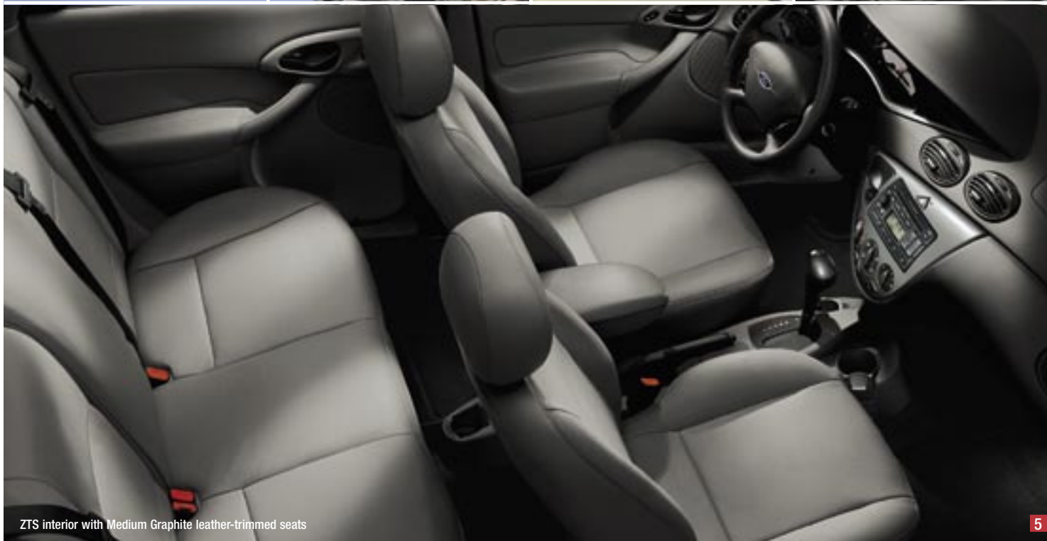
ZTS interior with Medium Graphite leather-trimmed seats