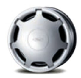
16" Full Wheel Cover