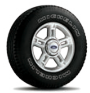
16" Painted Cast Aluminum Wheel Standard on XLS Sport and XLT