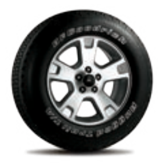
17" Machined Aluminum Wheel Standard on XLT Sport