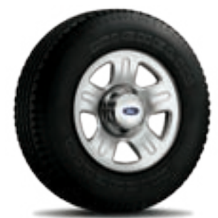
16" Full-Face Steel Wheel Standard on XLS