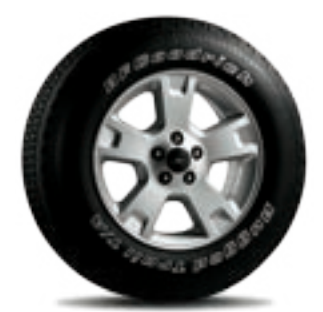
17" Sparkle Silver Aluminum Wheel Standard on XLT Appearance Package and Eddie Bauer