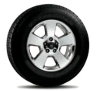
17" Chrome Aluminum Wheel Standard on Limited