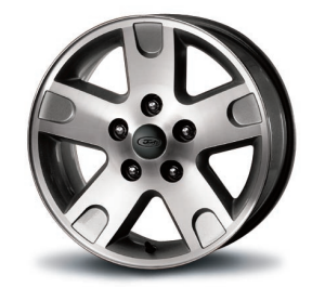
16" 5-Spoke Cast Aluminum Wheel