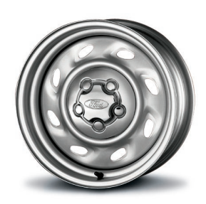
15" Argent Painted Steel Wheel