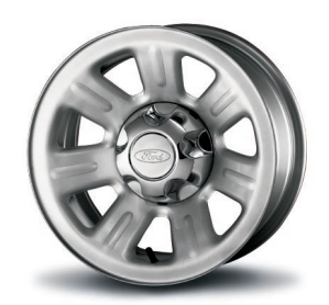
15" 7-Spoke Silver Painted Steel Wheel