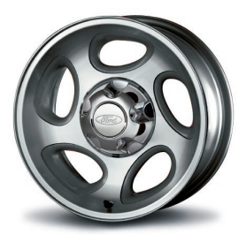
16" Cast Aluminum Wheel