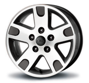
16" Machined Cast Aluminum Wheel