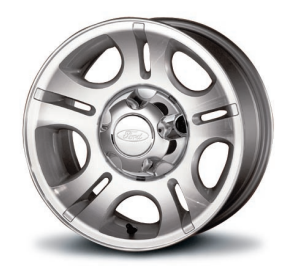
15" Machined "Split-Spoke" Cast Aluminum Wheel