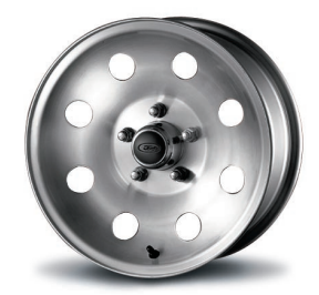
15" 8-Hole Forged Aluminum Wheel