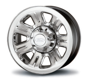
15" 7-Spoke Chrome Clad Steel Wheel