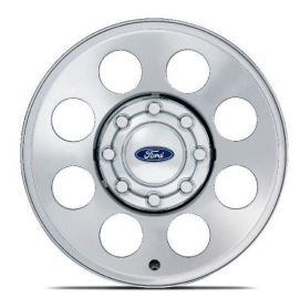
17" Forged Polished Aluminum Wheel