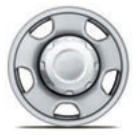
18" Argent Painted Steel Wheel