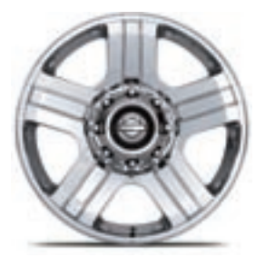
20" Polished Forged Aluminum Wheel (Harley-Davidson™ Only)

Not all wheels are shown. For further details, see your Ford Dealer. \label{eq:continuous}