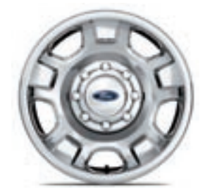
18" Chromed Steel Wheel