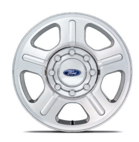
17" Premium Forged Polished Aluminum Wheel