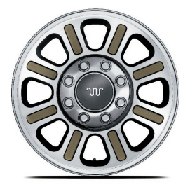
18" Painted Aluminum Wheel (King Ranch)