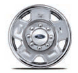
17" Chromed Steel Wheel