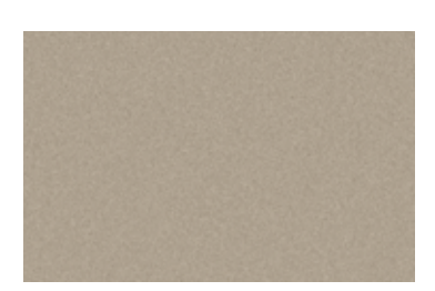
Arizona Beige Metallic