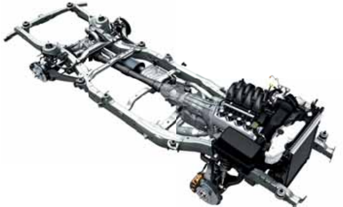
The 2006 Explorer's All-New, Fully Boxed Frame is a remarkable 63% stiffer than previous models. This solid foundation works with Explorer's refined powertrains and redesigned 4-wheel independent suspension (including new monotube shocks) to help deliver a smoother, quieter ride than ever.