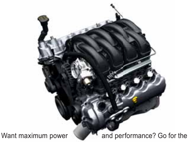
New 4.6L 3-Valve V8 Engine (above) mated to a first-in-class 6-speed automatic transmission. This available V8 delivers more grunt than ever before – a massive 292 hp and 300 lb.-ft. of torque. Explorer's standard 4.0L SOHC V6 is matched with a 5-speed automatic to pump out a substantial 210 hp and 254 lb.-ft. of torque.

*Based on 2006 model year EPA-estimated data (4x2: 15 mpg city/21 hwy.; 4x4: 14/20) as compared to 2005 model year.