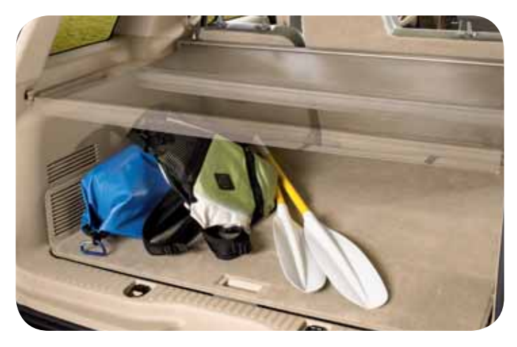
Explorer's Rear Cargo Shade , available on all 5-passenger models, is perfect for storing things away from prying eyes and keeping appearances tidy. With the rear seat folded down, 5-passenger models can handle up to a whopping 85.8 Cu. Ft. of gear – just imagine the possibilities.

Cargo and load capacity limited by weight and weight distribution. *As compared to Chevy TrailBlazer, Dodge Durango, Honda Pilot, Nissan Pathfinder and Toyota 4Runner.