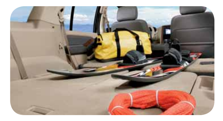
Explorer's 7-passenger models now feature a Flatter Loadfloor than many key competitors.* And with its 2nd- and 3rd-row seats folded flat, this Explorer can carry up to 83.7 cu. ft. of cargo.

Built to handle just about anything you can dream up, the new 2006 Explorer is ready for your next adventure. After a long day of activity, you'll be especially thankful for its all-new rear liftgate. It's so light and easy to operate that it can be closed with just one hand. A flip-open rear window makes packing small stuff easy, while the power lock/unlock button in the rear cargo area allows you to secure the vehicle in an instant.