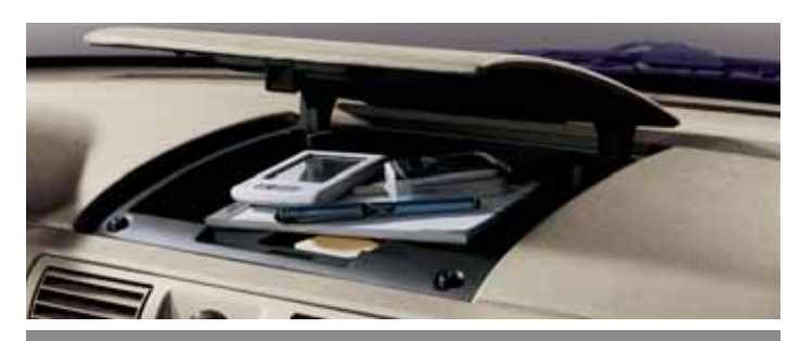
IN-DASH STORAGE COMPARTMENT