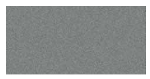
Spruce Green Metallic