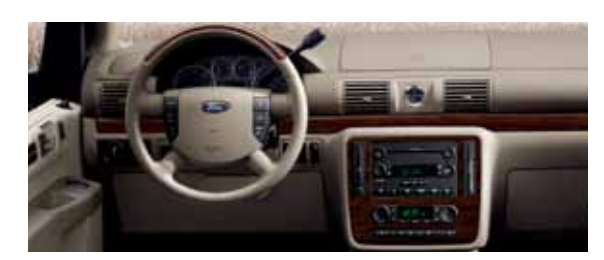
FREESTAR LIMITED INSTRUMENT PANEL Pebble Leather-Trimmed Interior with available equipment

Start each day behind the leather- and wood-trimmed steering wheel of a Freestar Limited. You'll sense the calm the minute you settle into its available leather-trimmed, 6-way power-adjustable, heated front seats. The gentle hug of the adjustable lumbar helps support you through every fun-filled curve. A cleanly designed instrument panel greets you with large, easy-to-read gauges and easy-to-reach buttons, including convenient steering wheel-mounted speed controls and audio system adjustments. And to keep you on schedule, a stylish analog clock provides a tasteful centerpiece. To create the most comfortable environment for everyone, Freestar Limited provides individual temperature settings for the driver and front passenger. 2nd-row climate controls also put rear-seat occupants in charge. Great sounds abound, compliments of a standard single-CD player, an available CD/cassette player, or a 6-disc in-dash audio system, with automatic volume control and rear-seat adjustments. If your passengers need a little power, Freestar Limited responds with four 12v outlets: 2 in front, 1 in the 2nd row, and 1 in the rear cargo area.