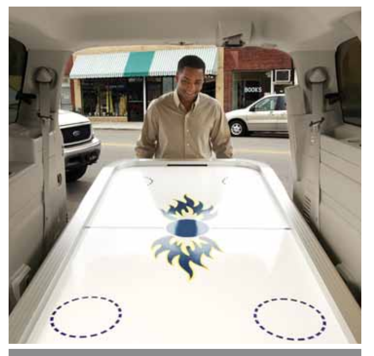
ENORMOUS CARGO ROOM