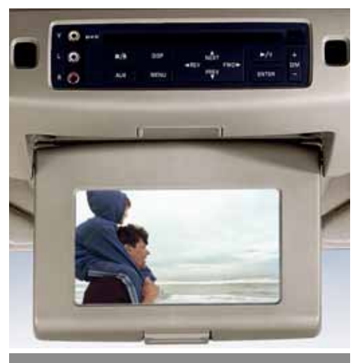
REAR-SEAT DVD ENTERTAINMENT SYSTEM Available on SE. SEL and Limited