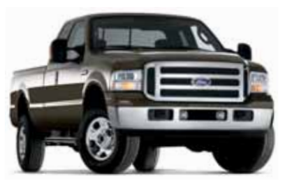
Dark Stone Metallic

Ford uses clearcoat paint for beauty and protection. Colors shown are representative only. Not all colors are available on all models. See your dealer for actual paint/trim options.