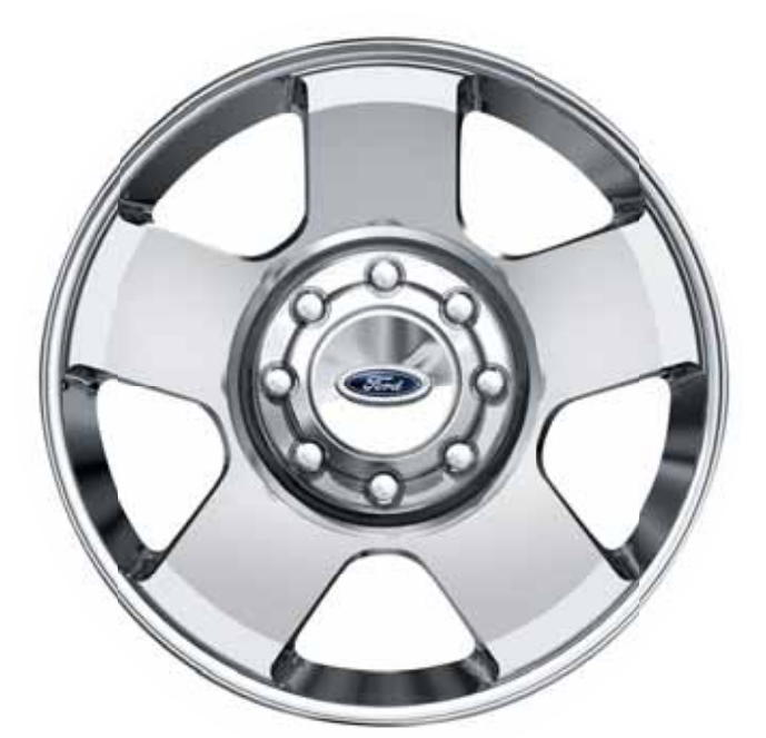
20" Forged-Aluminum Wheel option gives your Super Duty an aggressive look. Each wheel is forged from a single block of aluminum.

Chrome Package Special Equipment Available on XLT, LARIAT and King Ranch: • Chrome billet-style grille on XLT/LARIAT • Flat bar chrome grille on King Ranch • Chrome tow hooks • Chrome mirror caps • 5" Chrome tubular step bars • Chrome box tie-down hooks • Chrome exhaust tip • Requires SuperCab or Crew Cab