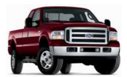
Dark Toreador Red Metallic