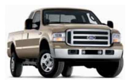
Arizona Beige Metallic

Ford uses clearcoat paint for beauty and protection. Colors shown are representative only. Not all colors are available on all models. See your dealer for actual paint/trim options.