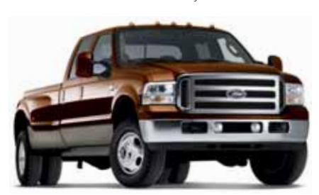
Dark Copper Metallic