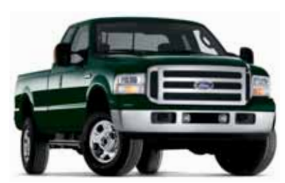
Dark Green Satin Metallic