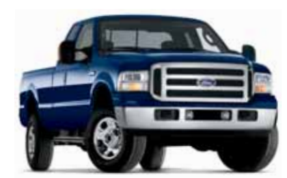
Medium Wedgewood Blue Metallic