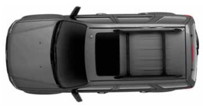
Sterling Grey Metallic