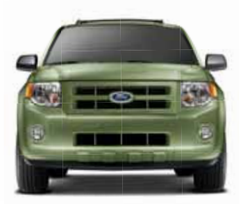
Kiwi Green Metallic