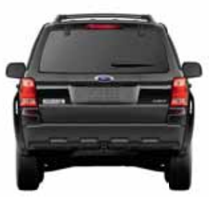
Black Pearl Slate Metallic