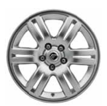
17" 6-SPOKE PAINTED-ALUMINUM AVAILABLE ON PREMIER