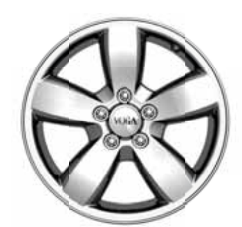
17" CHROME WITH "VOGA" CENTER CAPS AVAILABLE WITH VOGA PACKAGE