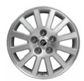
16" 12-SPOKE MACHINED-ALUMINUM STANDARD ON PREMIER