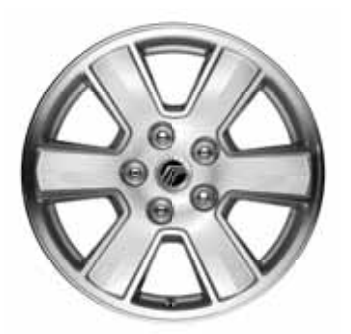
16" 6-SPOKE PAINTED-ALUMINUM STANDARD ON MARINER