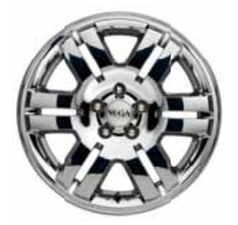
18" BRIGHT CHROME-CLAD AVAILABLE WITH VOGA PACKAGE

V-8 TOWING (lbs.) 4x2 standard 3500 AWD standard 3500 4x2 optional 7215<sup>1</sup> AWD optional 7040<sup>1</sup>