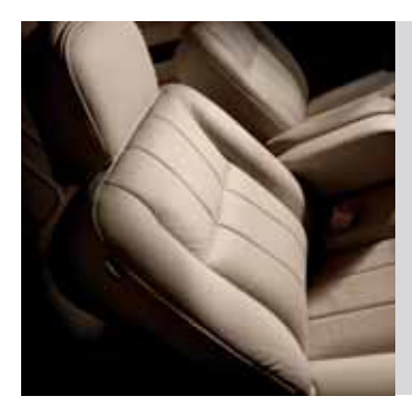
Living It Up. Rich and supple, the leathertrimmed seats are detailed to perfection grained and stitched with consummate craftsmanship.

Place. Get maximum use of the cavernous trunk with an assist from the cargo organizer.<sup>1</sup> Its adjustable dividers create handy storage units, and top panels are designed to form a flat floor whenever the unit is closed.