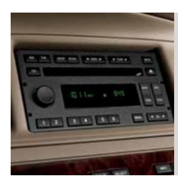
Listening With Utmost Pleasure.

Music, news, talk – AM, FM or CD – your preference, with a multitude of settings. Enjoy it all with multiple speakers strategically placed throughout the interior.