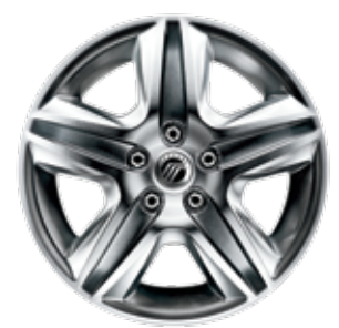
17" 5-SPOKE-DESIGN STEEL WHEELS WITH SILVER PAINT Available on Milan