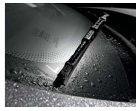
Automation. As the sprinkles turn into a downpour, Milan's speed-sensitive wipers can maximize visibility by speeding up on their own, allowing you to keep your hands on the steering wheel. You're free to focus on the road while other drivers are fumbling for their wipers.