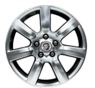
17" 7-SPOKE PAINTED-ALUMINUM WHEELS Standard on I-4 Premier and V-6 Premier