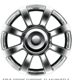
Included with VOGA Package