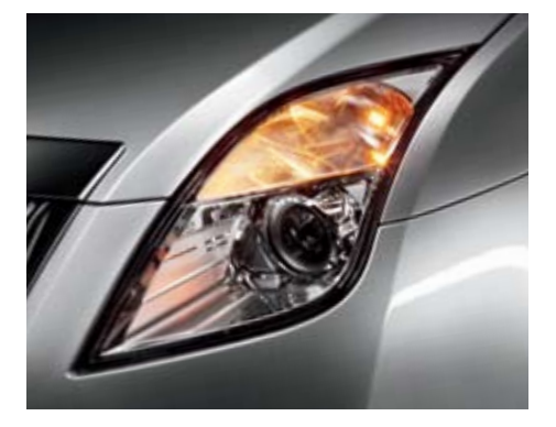
Illumination. An automatic headlamps feature on Milan Premier and Milan Hybrid turns the headlamps on and off automatically based on ambient light conditions.