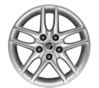
16" 5-SPOKE PAINTED-ALUMINUM WHEELS Standard on I-4 Milan