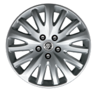
17" 15-SPOKE PAINTED-ALUMINUM WHEELS Standard on Milan Hybrid