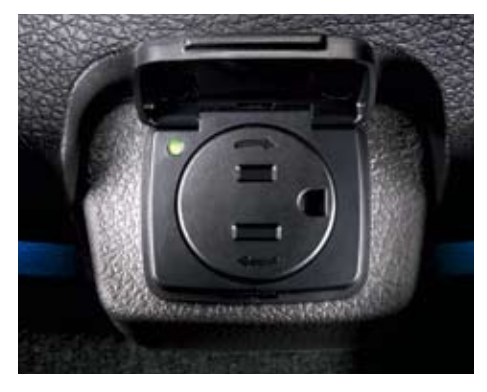
Preparation. Never have power when you need it? Now you do. To power laptops, digital media players, portable gaming systems and more, a convenient 110-volt outlet is always at the ready in Milan Hybrid.