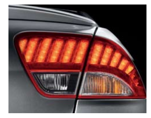
Integration. Milan's LED taillamps use less energy and illuminate more quickly than conventional bulbs. On Milan and Milan Hybrid, they're further accentuated by an available rear spoiler.