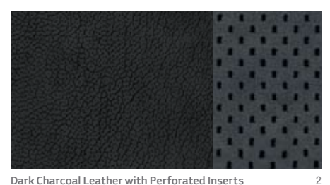
Dark Charcoal Leather with Perforated Inserts

1: Milan 2: Milan Premier 3: Milan Hybrid 4: VOGA Package