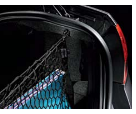
Organization. Ultimate control comes to those who keep their worlds uncluttered. To help, Milan's spacious trunk includes a storage net that's perfect for holding items that are prone to "rolling." Not shown: A dash-top storage bin that keeps items at your fingertips at all times, as well as 6 bottle/beverage holders in Milan's interior.