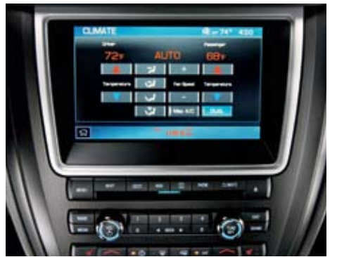
Activation. On models equipped with Milan's available voice-activated touch-screen Navigation System, the Dual-zone Electronic Automatic Temperature Control can be operated 2 ways: by voice (say "Temperature Up" or "Temperature Down"); or by touching the up or down arrows on the Navigation System's Climate screen.