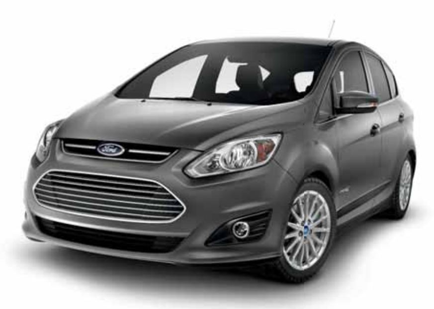
SEL. Sterling Gray Metallic. Available equipment.

Your vehicle's unique electric components are covered during the Hybrid Unique Component Coverage, which lasts for 8 years or 100,000 miles, whichever occurs first. Please refer to your Warranty Guide for coverage details.