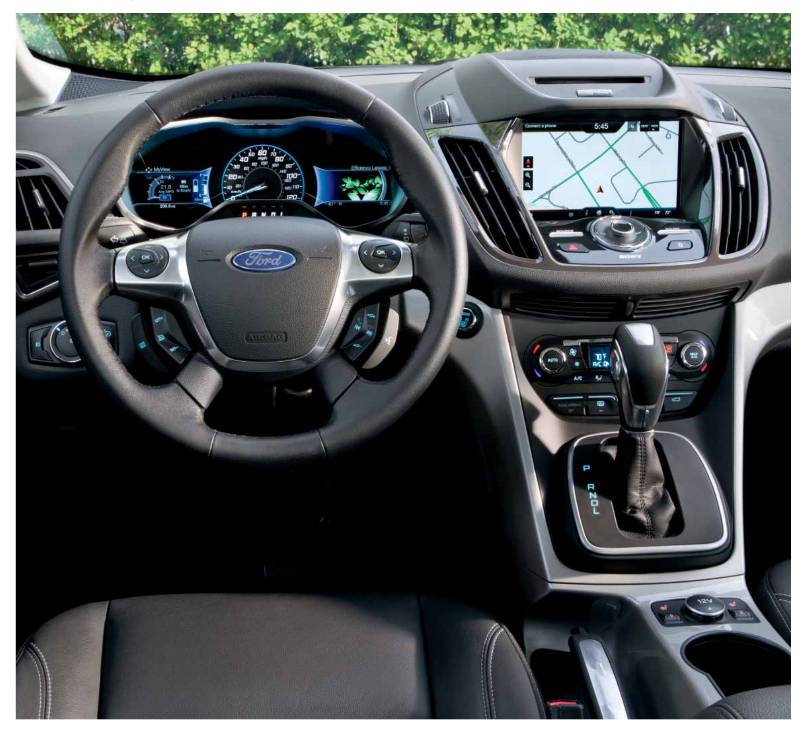
SEL. Charcoal Black leather trim. Available equipment. I Intelligent Access with push-button start! I 110-volt power outlet. I Heated front seats! 12-volt powerpoint. I SE. Charcoal Black cloth seat with Warm Steel accents.