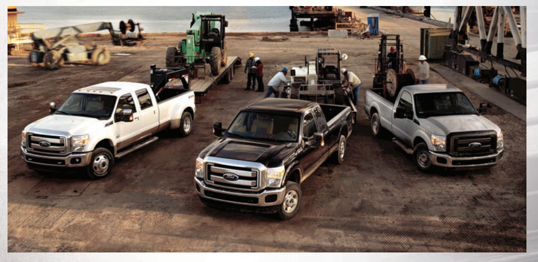
F-450 LARIAT CREW CAB, F-350 XLT SUPERCAB AND F-250 XL REGULAR CAB

$1,000 Plow Upfit Assistance<sup>1</sup>