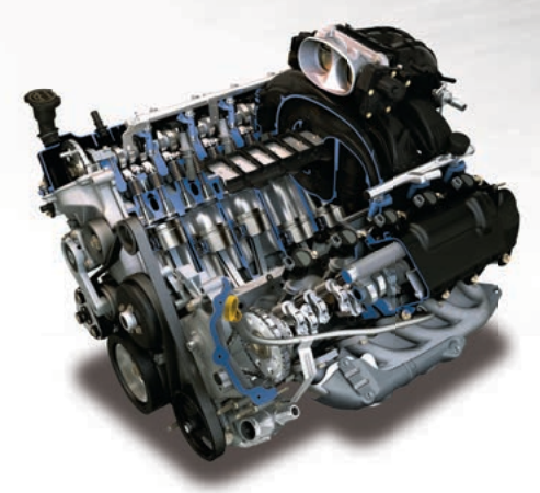
AVAILABLE CLASS-EXCLUSIVE 6.8L CNG/LPG FUEL CAPABLE GAS V10 ENGINE

<sup>1</sup> Available on upfits costing $1,200 or more. Excludes available factory-installed options. Take new retail delivery from dealer stock by 7/31/13. Restrictions apply. See dealer for details. <sup>2</sup> Class 6 and 7 Chassis Cab. <sup>3</sup> When properly equipped. <sup>4</sup> Available on F-650.