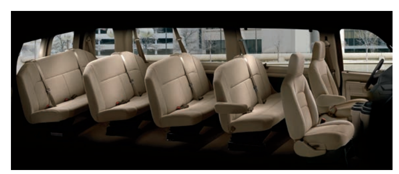
SEATING CONFIGURATIONS FOR UP TO 15

Professionally created and permanently installed paint or vinyl company graphics and logos