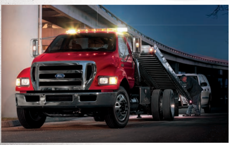
F-650 XLT REGULAR CAB UPFITTED FOR FLATBED TOWING