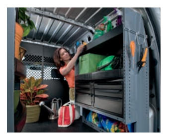
LEGGETT & PLATT SYSTEM