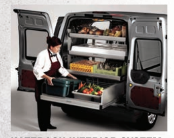
KATERACK INTERIOR SYSTEM SORTIMO INTERIOR SYSTEM