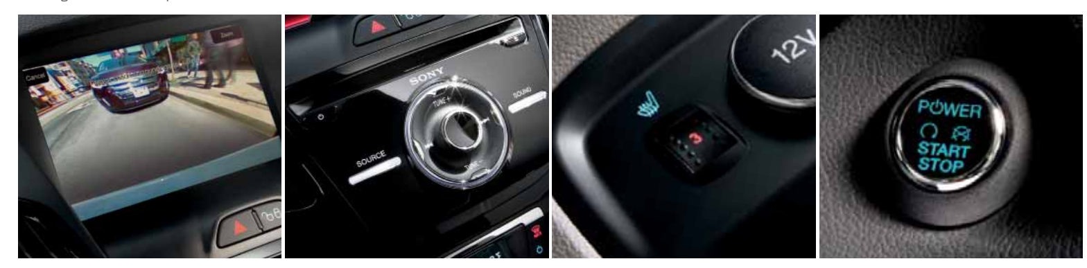
Comparisons based on 2012 competitive models (class is Small Electric Cars), publicly available information and Ford certification data at time of release. Some features discussed may be optional. Vehicles shown may contain optional equipment. Features shown may be offered only in combination with other options or subject to additional ordering requirements or limitations. Dimensions shown may vary due to optional features and/or production variability. Following release of the PDF, certain changes in standard equipment, options and the like, or product delays may have occurred which would not be included in these pages. Your Ford Dealer is the best source for up-to-date information. Ford Division reserves the right to change product specifications at any time without incurring obligations.