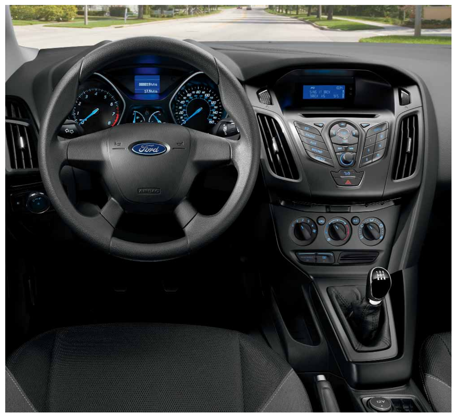
Warm Steel cloth trim. Charcoal Black inserts. | 13.2 cu. ft. of luggage capacity (sedan). | Easy Fuel® capless fuel filler. | Power sideview mirror with integrated blind spot mirror. | PowerShift 6-speed automatic transmission.