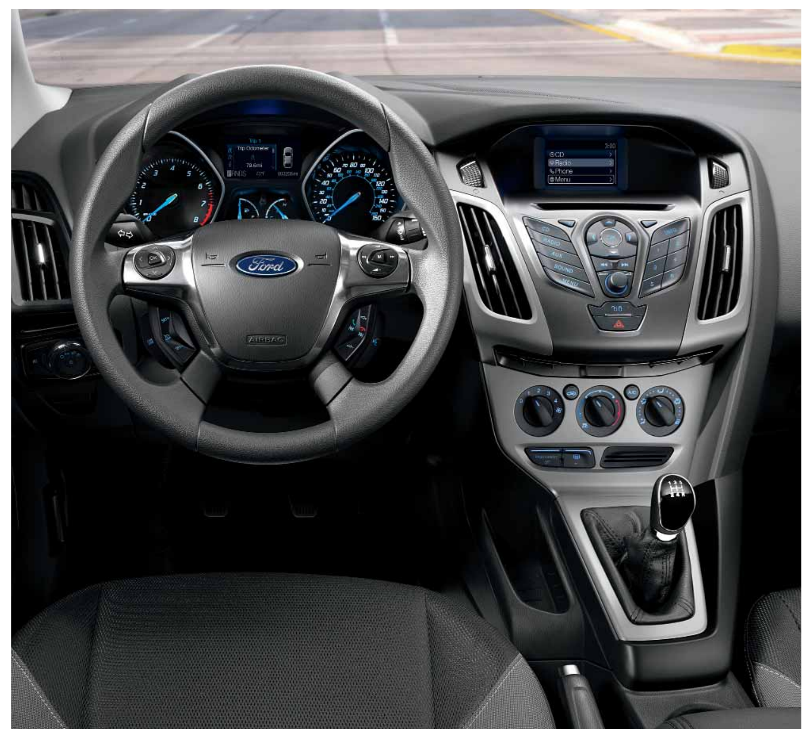
Warm Steel cloth trim. Charcoal Black inserts. Available equipment. | Tuscany Red Interior Style Package. Available equipment. | Sedan. Rear spoiler. | Arctic White Interior Style Package. Available equipment.