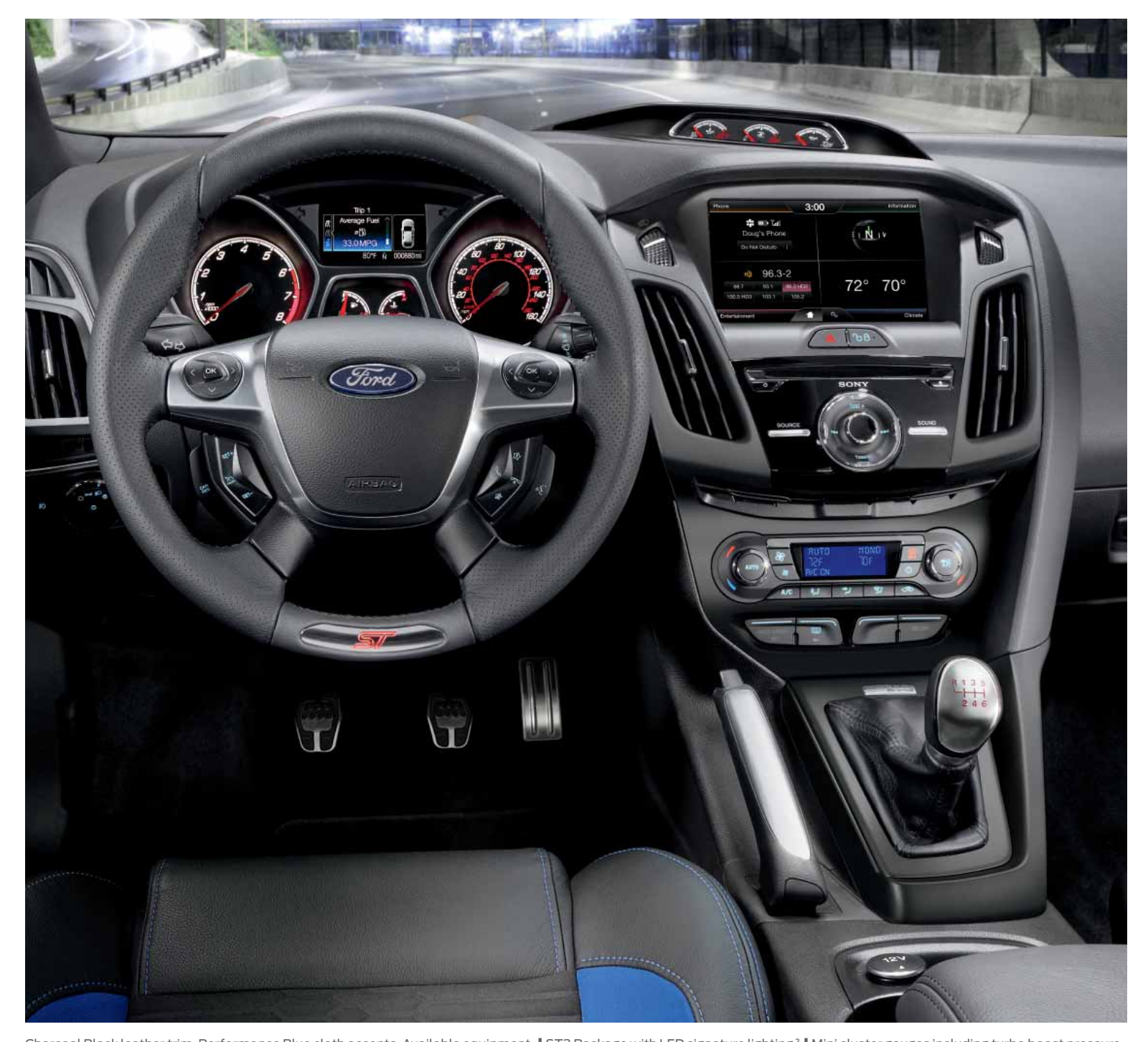
Charcoal Black leather trim. Performance Blue cloth accents. Available equipment. | ST3 Package with LED signature lighting.<sup>2</sup> | Mini cluster gauges including turbo boost pressure. | Piano Black mesh grille with exclusive ST badging. | Center tailpipe exhaust with dual bright tips.