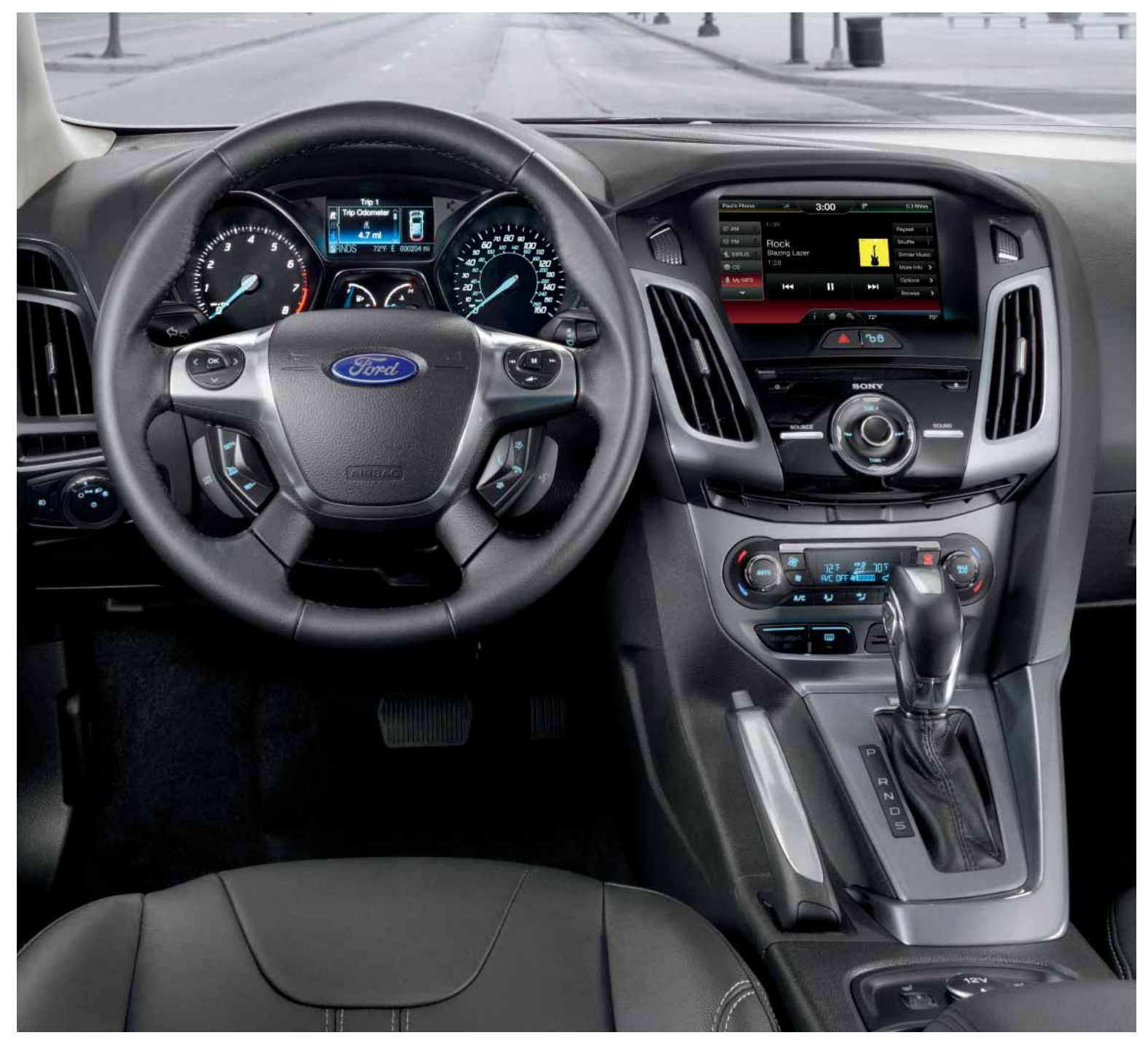
Charcoal Black leather trim. Charcoal Black inserts. SYNC® with MyFord Touch.® Available equipment. ▮ Intelligent Access with push-button start. ▮ Rear view camera. ▮ Audio System from Sony® with 10 speakers and HD Radio™ Technology.