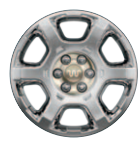
20" Chrome-Clad Aluminum with King Ranch Center Caps Optional