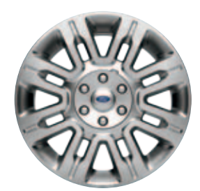
20" Polished Aluminum Optional