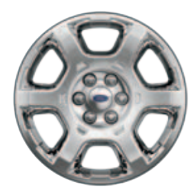
20" Chrome-Clad Aluminum Optional