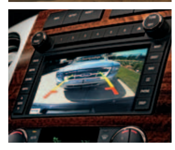
XLT. Stone leather trim. Available equipment.

XLT. Full-size spare tire. Class IV trailer tow receiver with 4-pin connector.