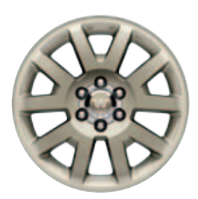
20" Premium Painted Aluminum with King Ranch Center Caps Optional