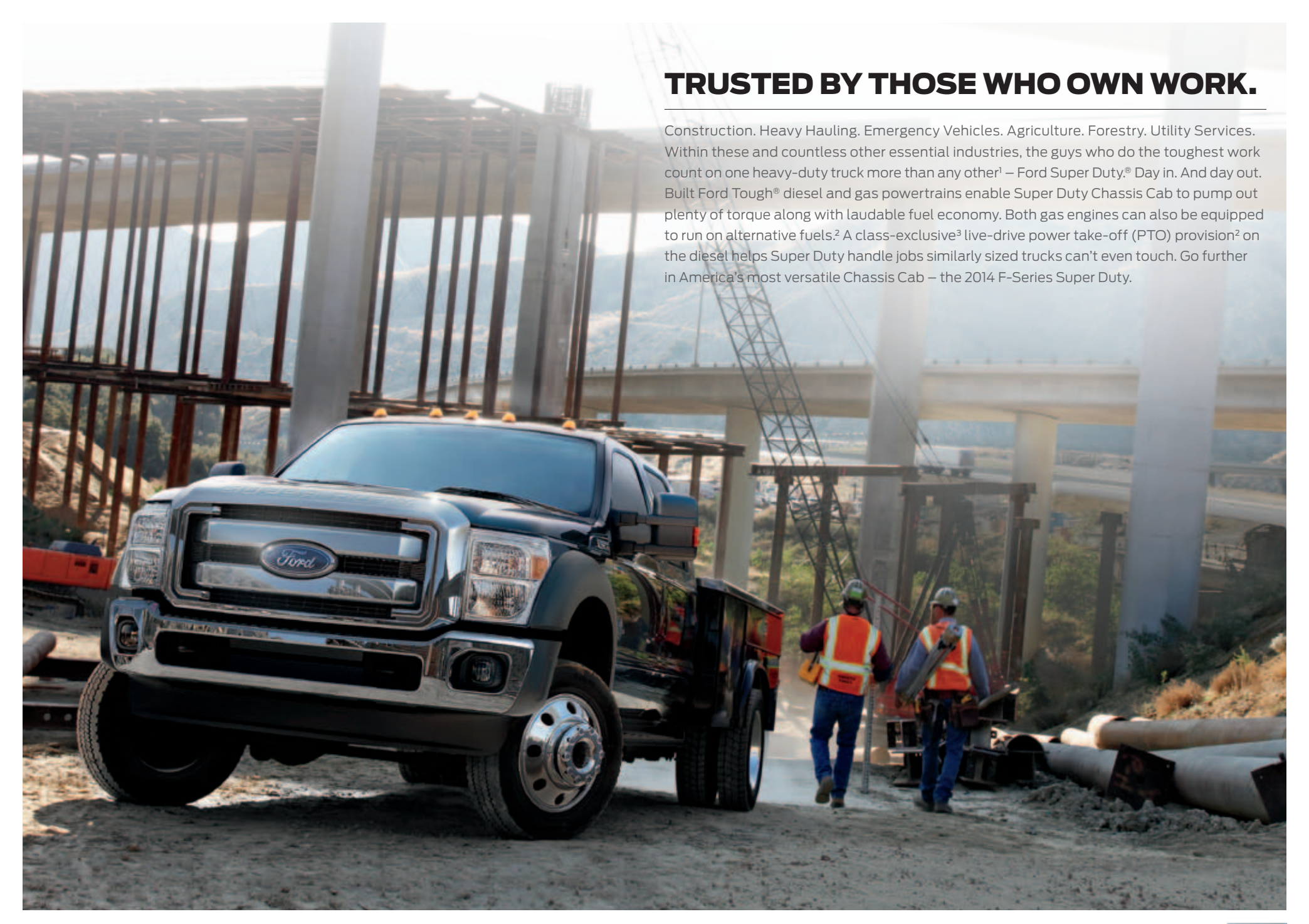
F-550 XLT Crew Cab 4x4. Tuxedo Black. Available and aftermarket upfit equipment.