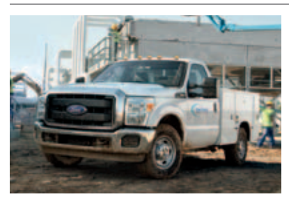
F-350 XL Regular Cab 4x2. Oxford White. XL Appearance Package. Available and aftermarket upfit equipment.