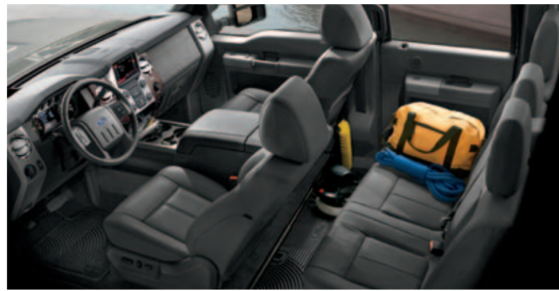
F-550 LARIAT SuperCab 4x2. Kodiak Brown. Available and aftermarket upfit equipment. Charcoal Black leather trim. Available equipment.