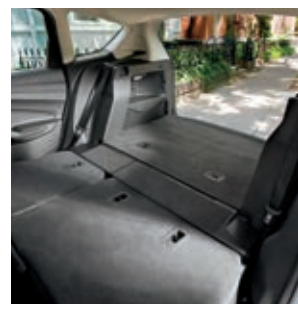
Watch the liftgate open