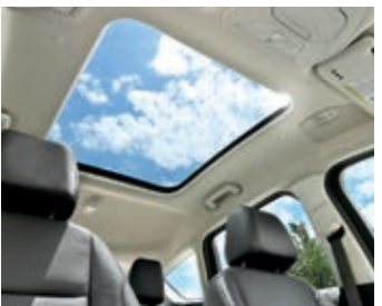
SEL. Charcoal Black leather trim. Available equipment.