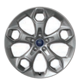
19" Luster Nickel-Painted Aluminum Optional