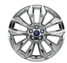
19" Chrome-Like Alloy Finish Included: Chrome Package on SE