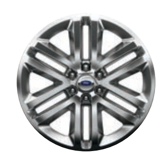
22" Polished Aluminum Optional