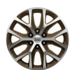
20" Bright-Machined Aluminum with Caribou-Painted Pockets and King Ranch Center Caps Standard

King Ranch logo embroidered on floor mats.