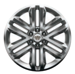
22" Polished Aluminum with King Ranch Center Caps Optional