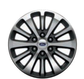
18" Bright-Machined Aluminum with Magnetic-Painted Pockets Standard