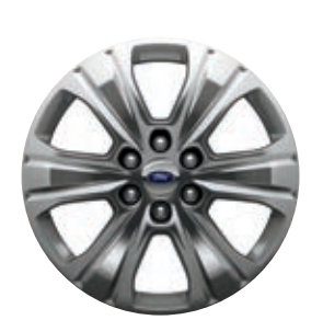
20" Polished Aluminum Standard

Chrome liftgate appliqué with satin-aluminum finish accent bar.