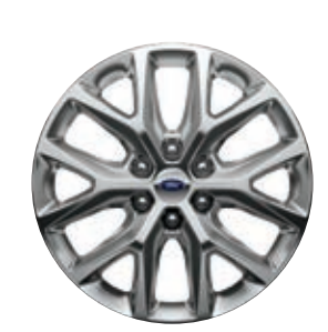
20" Polished Aluminum Standard