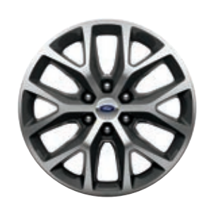
20" Bright-Machined Aluminum with Magnetic-Painted Windows Available