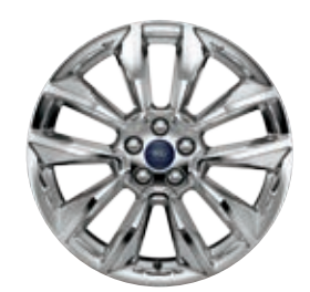
19" Chrome-Like Alloy Finish Included: Chrome Package on SE