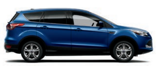
Deep Impact Blue*