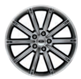
19" Premium Luster Nickel-Painted Aluminum Standard

High-intensity discharge (HID) headlamps.