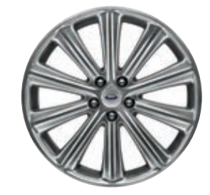
20" Bright-Painted Aluminum Available: SEL