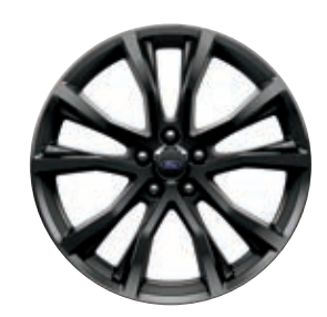
20" High-Gloss Black-Painted Aluminum Included: Appearance Package