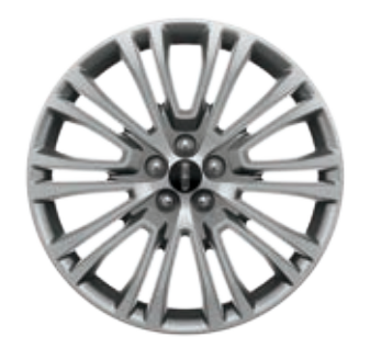
20" Premium Painted and Bright-Machined 20-Spoke Aluminum

Standard RESERVE (FWD models; AWD with 3.7-liter V6)