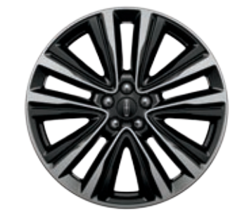
20" Premium Painted and Bright-Machined 10-Spoke Aluminum

Standard RESERVE (FWD models; AWD with 3.7-liter V6)