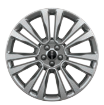
21" Premium Painted and Bright-Machined Aluminum

Standard RESERVE (AWD with 2.7-liter GTDI V6)