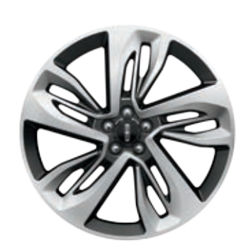
21" Polished Aluminum Optional RESERVE