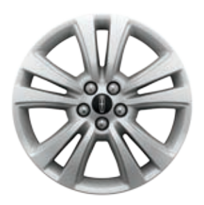
18" Painted Aluminum Standard PREMIERE

Available SELECT and RESERVE<sup>1</sup>