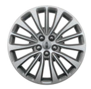
18" Premium Painted Aluminum Standard SELECT

Available SELECT and RESERVE<sup>1</sup>