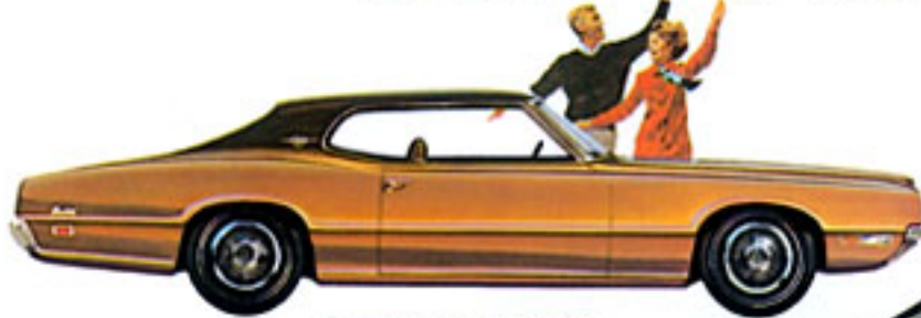
Two-Door Hardtop with option vinyl roof