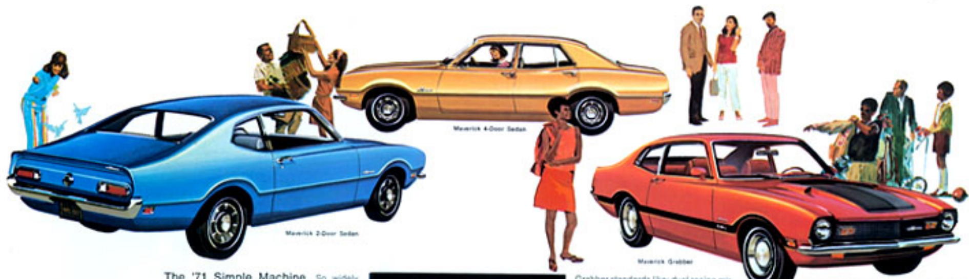
Maverick 2-Door Sedan

No changes in the simple machine...except for a couple of extra doors...and a little more jazz.