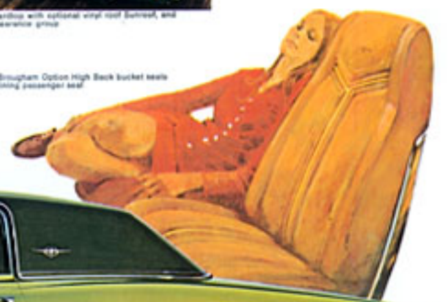
Special Brougham Option High Back bucket seats with reclining passenger seat