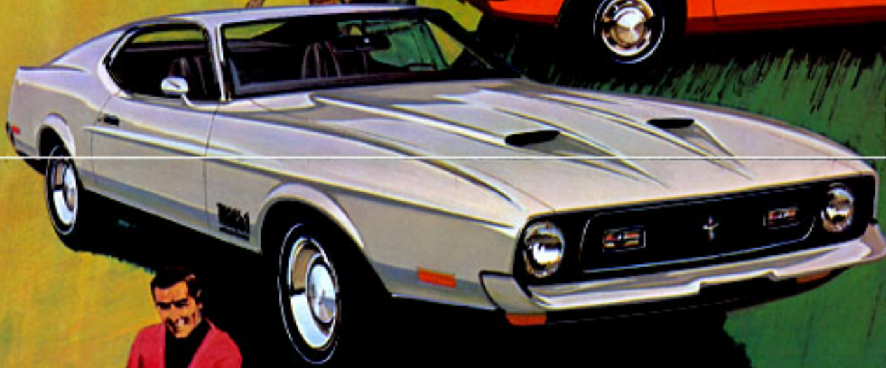
Mustang Mach 1