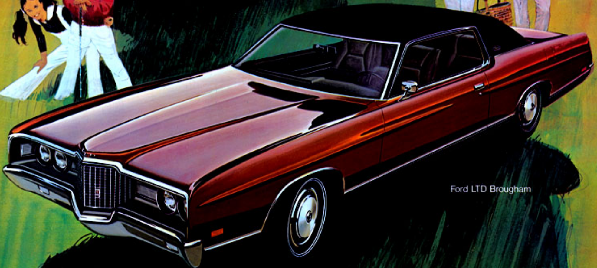
Ford LTD Brougham