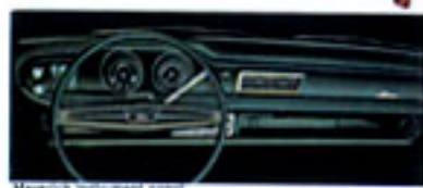
Maverick instrument panel

Family economy Maverick. Now you can enjoy two extra doors for easier ins and outs—if you like your Maverick family style. For