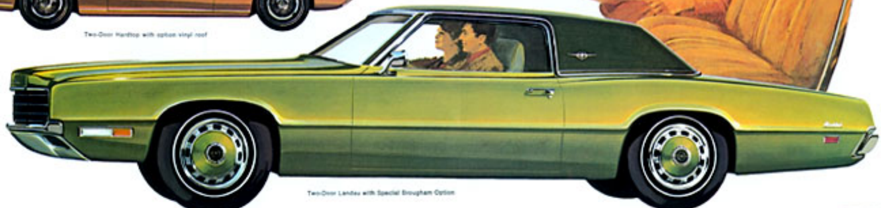
Two-Door Landau with Special Brougham Option