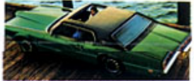
Two-Door Hardtop with optional vinyl roof, sunroof, and exterior appearance grille

Options. A wide array of Thunderbird op-