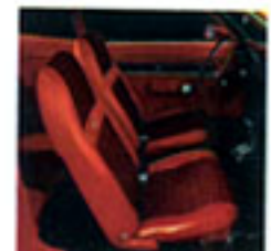
Maverick Grabber standard interior

tooth, black, white, red or gold tweed. There's a wide selection of 14" tires, including belted beauties in white sidewalls—wheel covers. Optional stripe-patterned fabrics and new High Back bucket seats—for a sportier interior. A rear window defogger. And that's just a partial list.