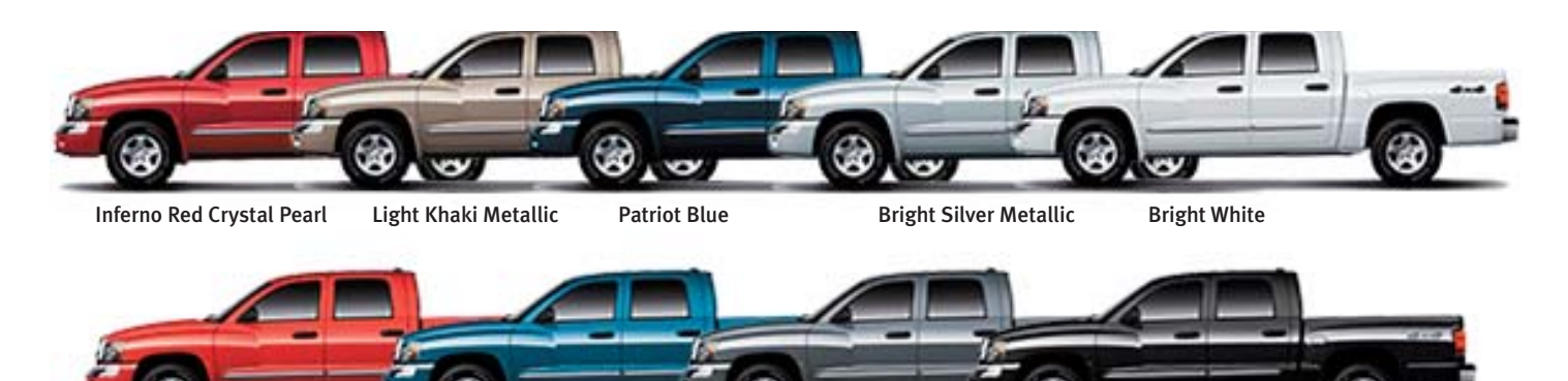
Flame Red Atlantic Blue Mineral Gray Metallic