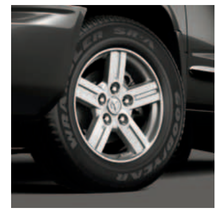
18-inch Painted Cast Aluminum Wheel (Standard on Laramie, Available on Big Horn/Lone Star)