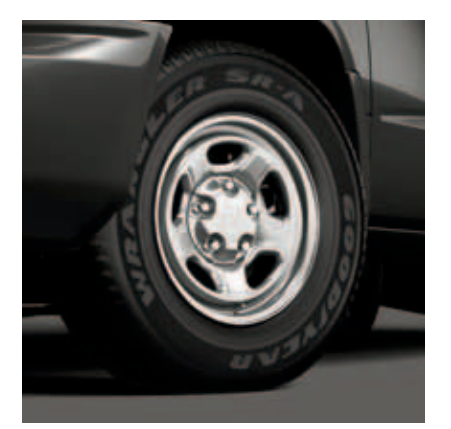
16-inch Styled Steel Wheel (Standard on ST)