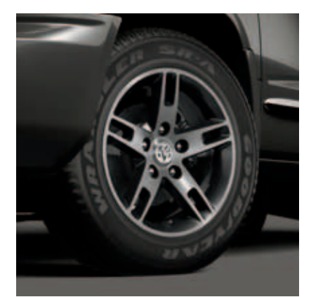
18-inch Machined-Face, Black Pocket Chrome Cast Aluminum Wheel (Authentic Accessory by Mopar)