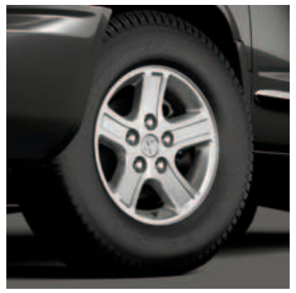
17-inch Cast Aluminum Machined Wheel (Standard on Big Horn/Lone Star)