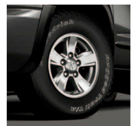
16-inch Painted Cast Aluminum Wheel (Available on ST)