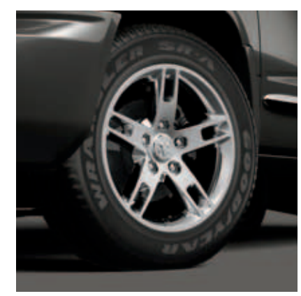
18-inch Chrome Cast Aluminum Wheel (Authentic Accessory by Mopar®)