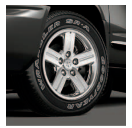
18-inch Chrome-Clad Aluminum Wheel (Available on Laramie)