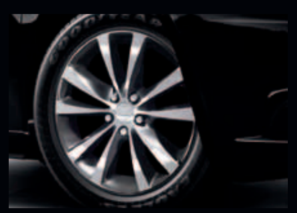
18-INCH POLISHED ALUMINUM WHEFT WITH BLACK PAINTED POCKETS Standard on S

18-INCH POLISHED ALUMINUM WHEEL Standard on Limited.