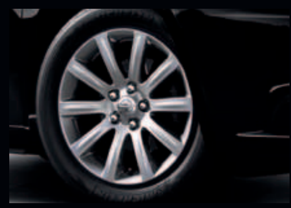
17-INCH ALUMINUM WHEEL Standard on Touring.