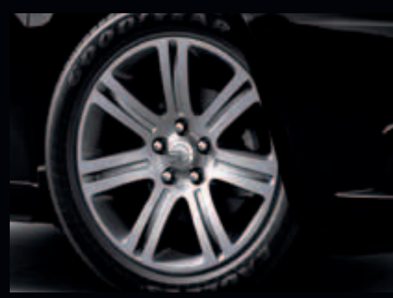
18-INCH CAST ALUMINUM WHEEL WITH PAINTED SATIN SILVER FINISH