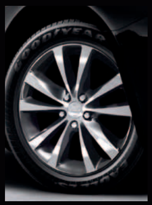
18-INCH POLISHED ALUMINUM WHEEL WITH BLACK PAINTED POCKETS Standard on S.