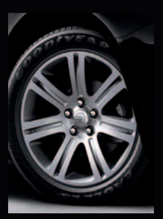
18-INCH CAST ALUMINUM WHEEL WITH PAINTED SATIN SILVER FINISH Optional on Touring.