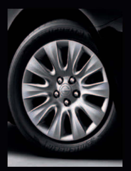
17-INCH WHEEL COVER Standard on LX.