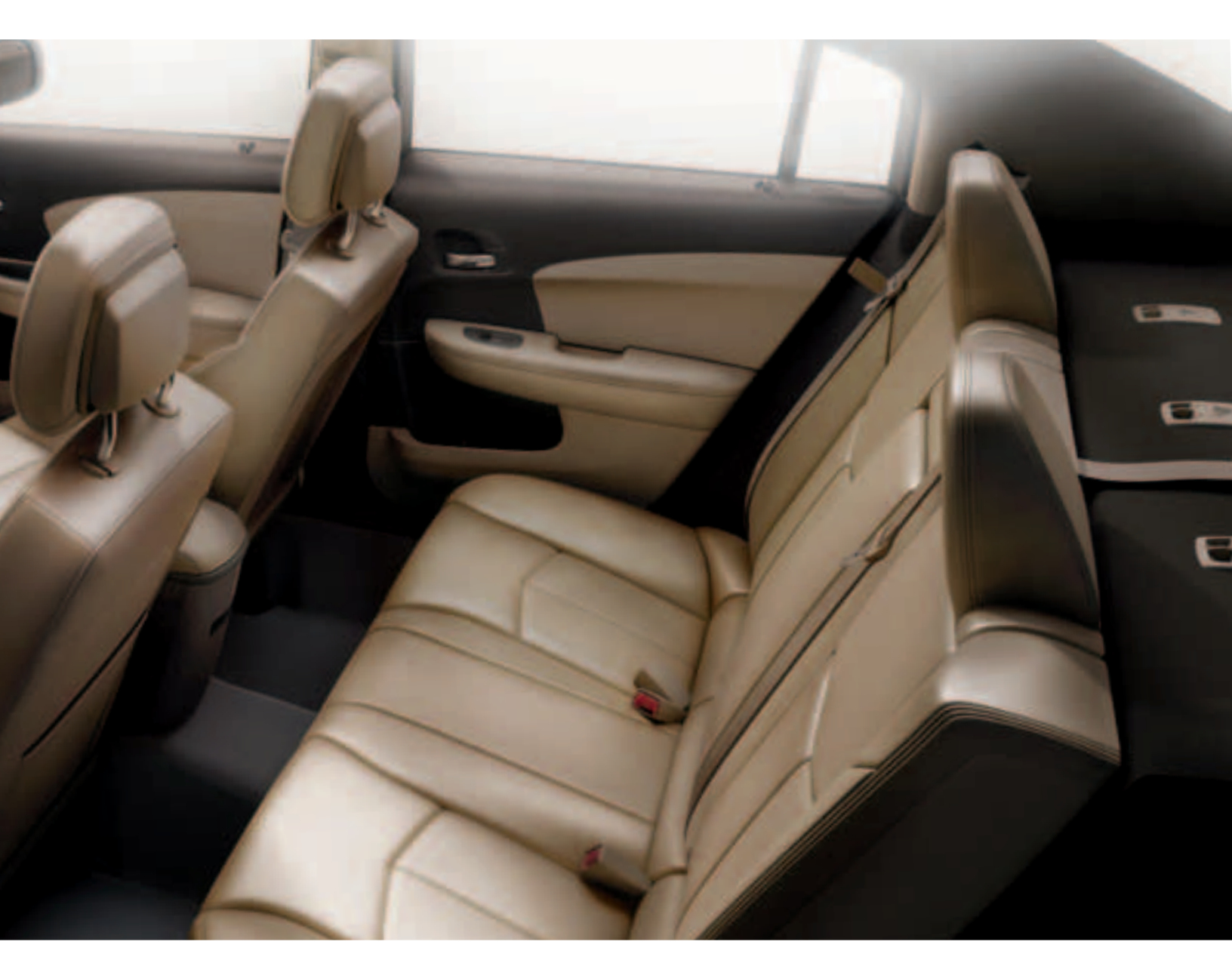
REAR SEAT WITH TRUNK PASS-THRU. Rear-seat passengers enjoy spacious, comfortable seating. And the trunk pass-thru provides additional cargo capacity, allowing longer items to be stored in the trunk.