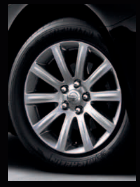
17-INCH ALUMINUM WHEEL Standard on Touring.