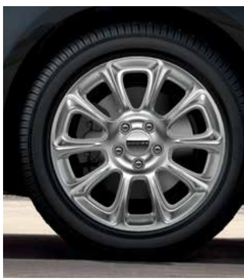
17-inch Satin Silver aluminum (standard on Limited)