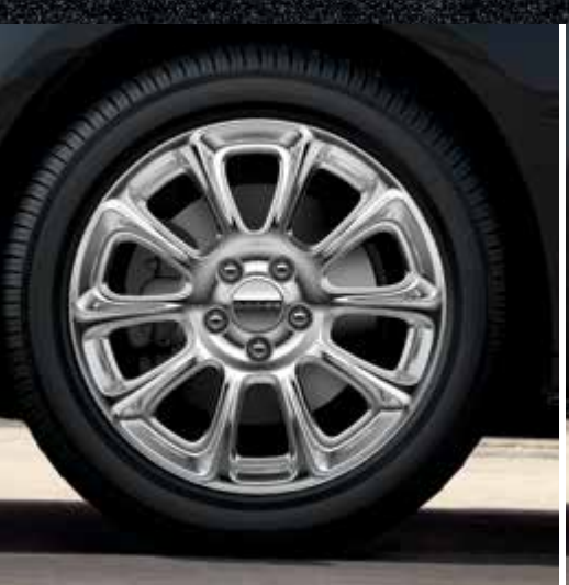
17-inch polished aluminum (optional on Limited)