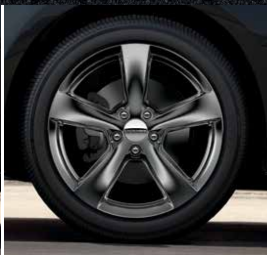
18-inch Hyper Black aluminum (optional on GT)