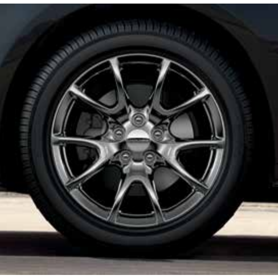
17-inch Hyper Black aluminum (included in Rallye Appearance Group on SXT)