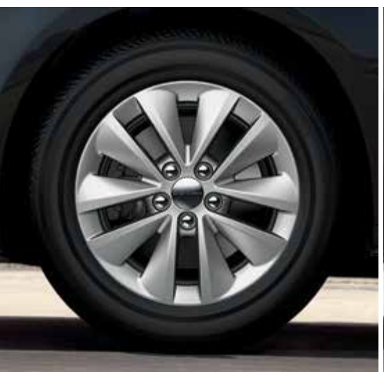
16-inch Tech Silver aluminum (standard on SXT and Aero)