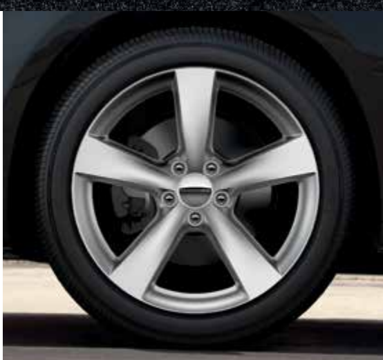
18-inch Satin Silver aluminum (standard on GT)