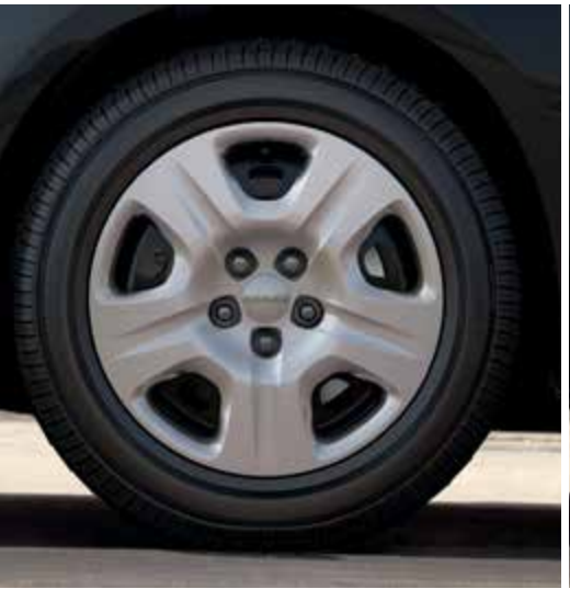
16-inch wheel cover (standard on SE)