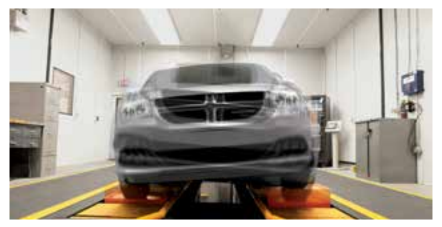
FOUR-POST SHAKER — SUSPENSION TESTING