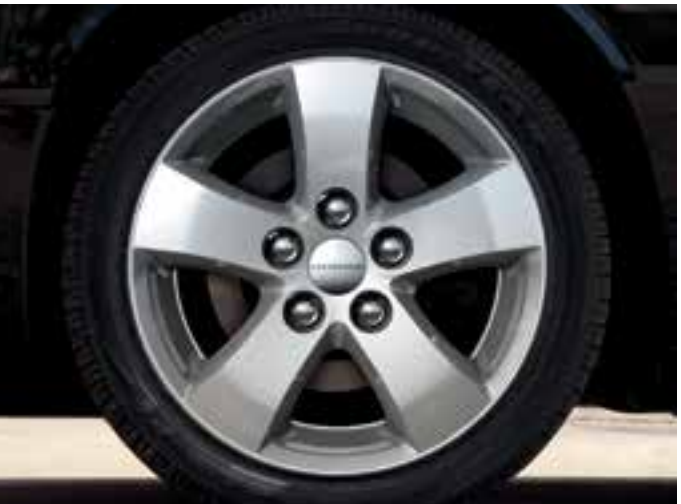
17-inch aluminum (optional on SE)