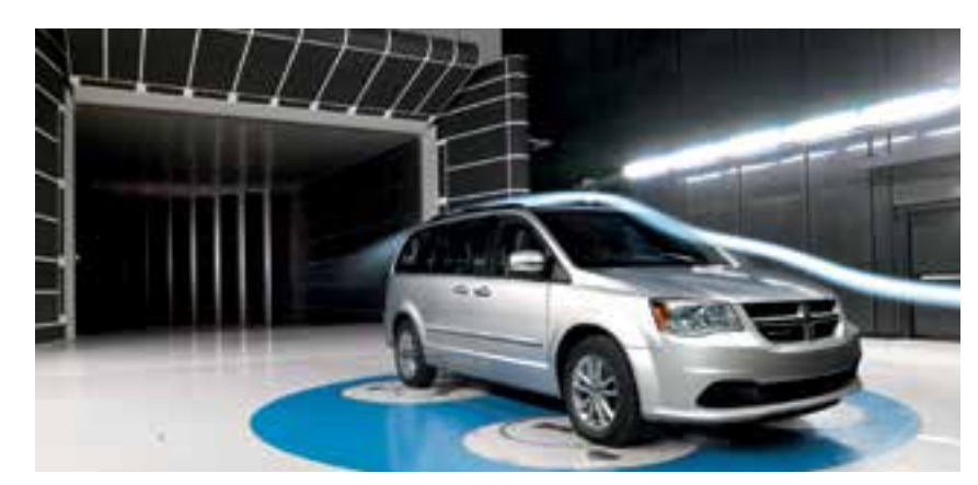
WIND TUNNEL TESTING