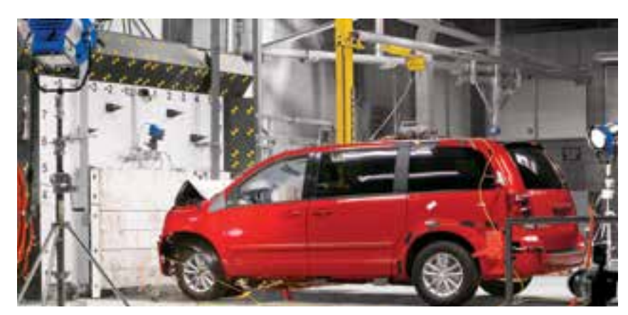
CRUSH ZONE TESTING