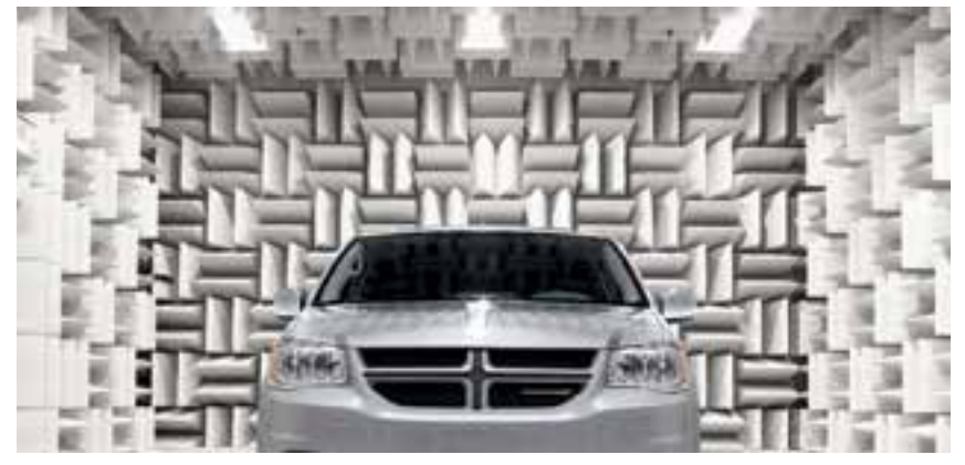
ANECHOIC CHAMBER — NOISE, VIBRATION AND HARSHNESS (NVH) TESTING