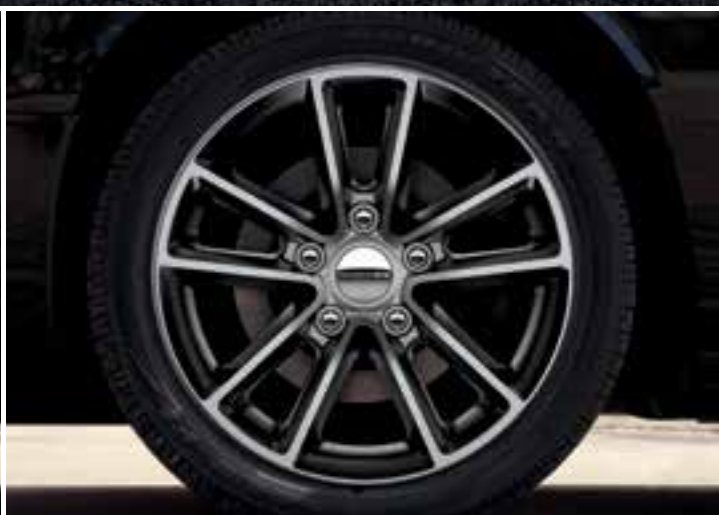
17-inch polished aluminum with Gloss Black pockets (included in Blacktop Package on SE and SXT)