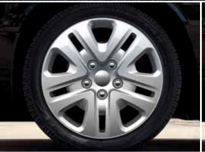
17-inch wheel cover (standard on AVP and SE)