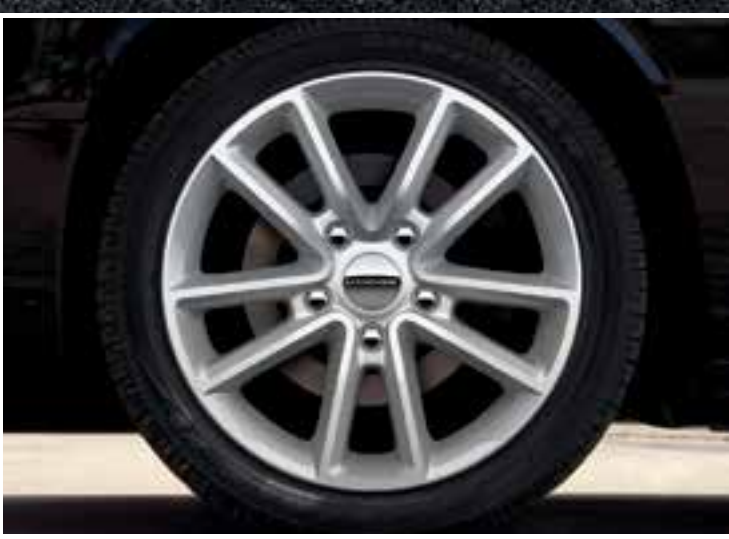
17-inch Tech Silver aluminum (standard on SXT)