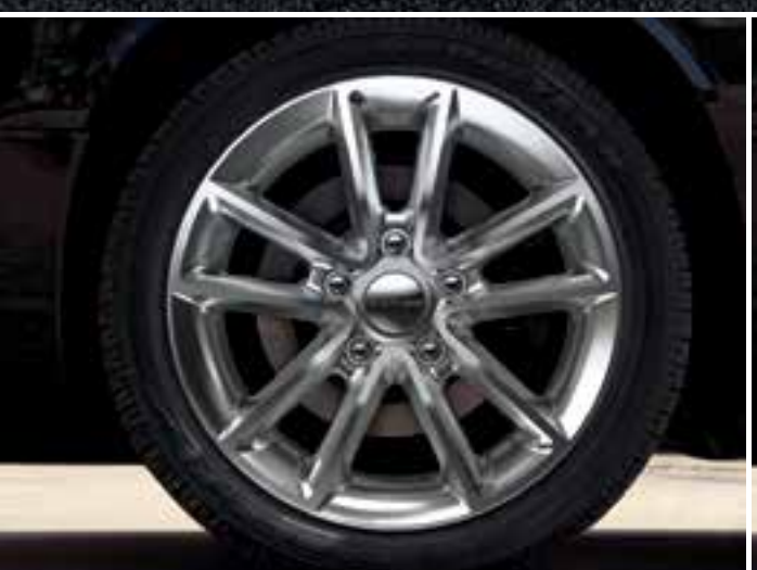
$17\mbox{-inch Satin Carbon aluminum}$ (standard on SE 30\mbox{\sc th} Anniversary Edition* and R/T)