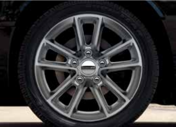
17-inch polished aluminum with Satin Carbon pockets (standard on SXT 30<sup>th</sup> Anniversary Edition)