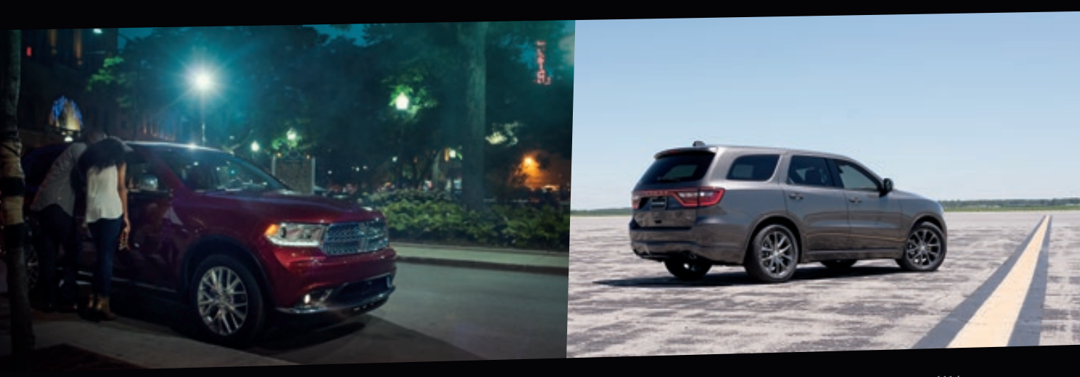
//// MOST TECHNOLOGICALLY ADVANCED, FUEL-EFFICIENT AND POWERFUL SUV IN ITS CLASS[1]*