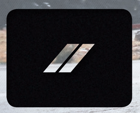
BRILLIANT BLACK CRYSTAL PEARL