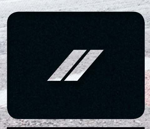
BLACK FOREST GREEN PEARL*