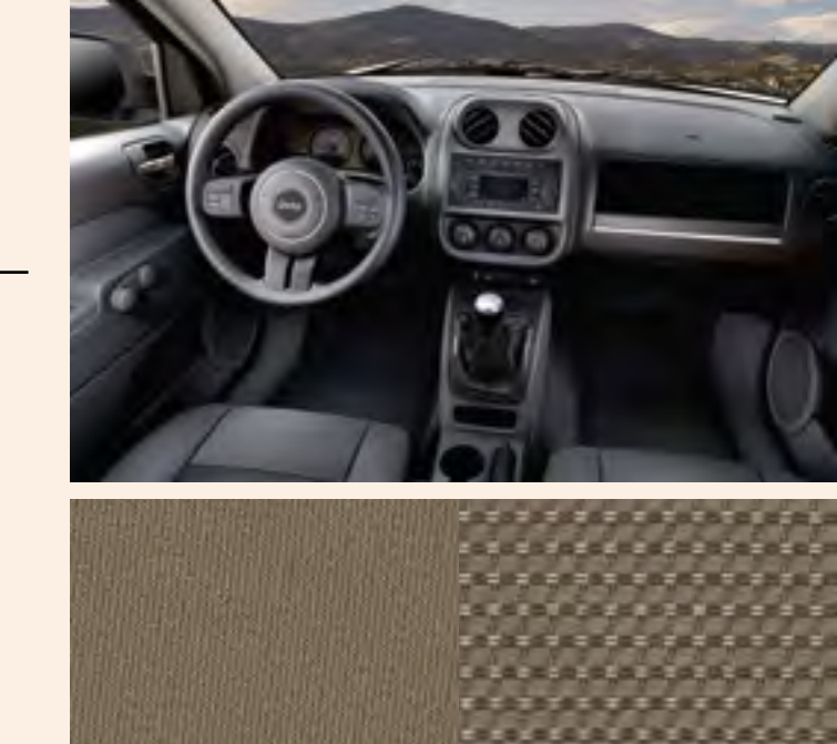
Duet Cloth/Cubic Cloth — Light Pebble Beige with Beige accent stitching (standard)