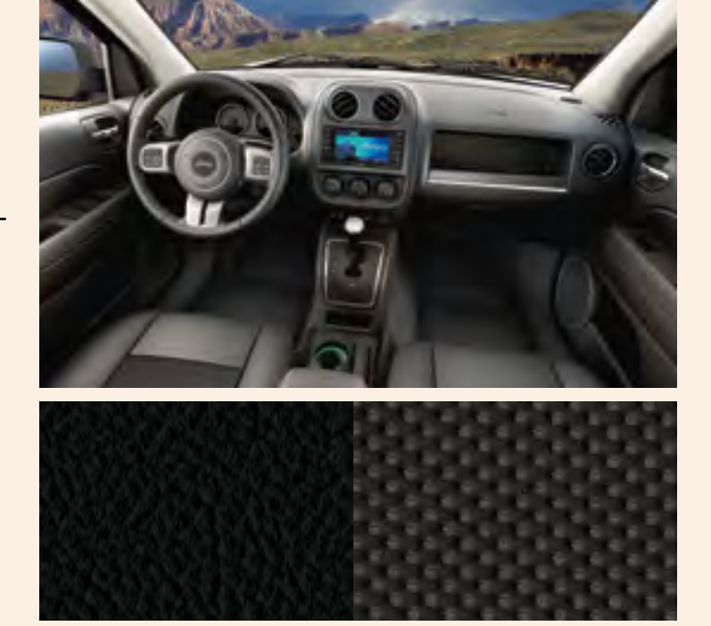
McKinley Vinyl/Sport Mesh Cloth — Dark Slate Gray/Black with Light Slate Gray accent stitching (standard)