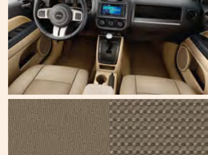
Duet Cloth/Cubic Cloth — Light Pebble Beige with Beige accent stitching (standard)

SMOKER'S GROUP: Includes removable ashtray and lighter element