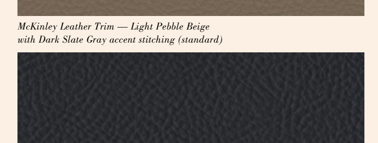
McKinley Leather Trim — Dark Slate Grav with Light Slate Gray accent stitching (standard)