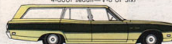
Belvedere wagons (Sport Satellite 2- and 3-seat models—V-8) (Satellite 2- and 3-seat models—V-8 or Six) (Belvedere 2-seat model—V-8 or Six)