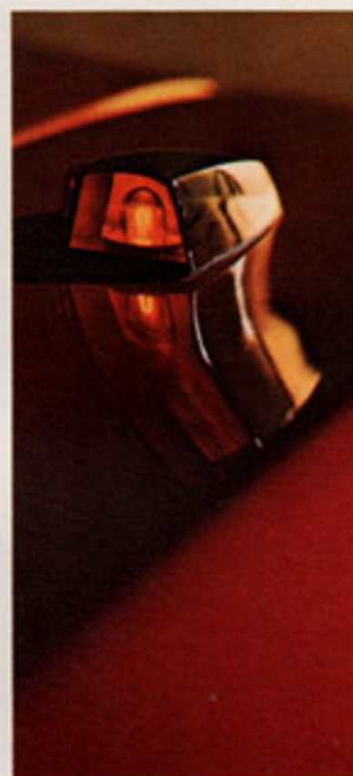
Keeping your eye on the road makes it. Fender-mounted turn indicators. Right out front on top of the fenders. Where you can see them without taking your eyes off the road. In addition, Valiant light packages also include trunk and glove box lights, ignition switch with time-delay light, and ashtray, map and courtesy lights.