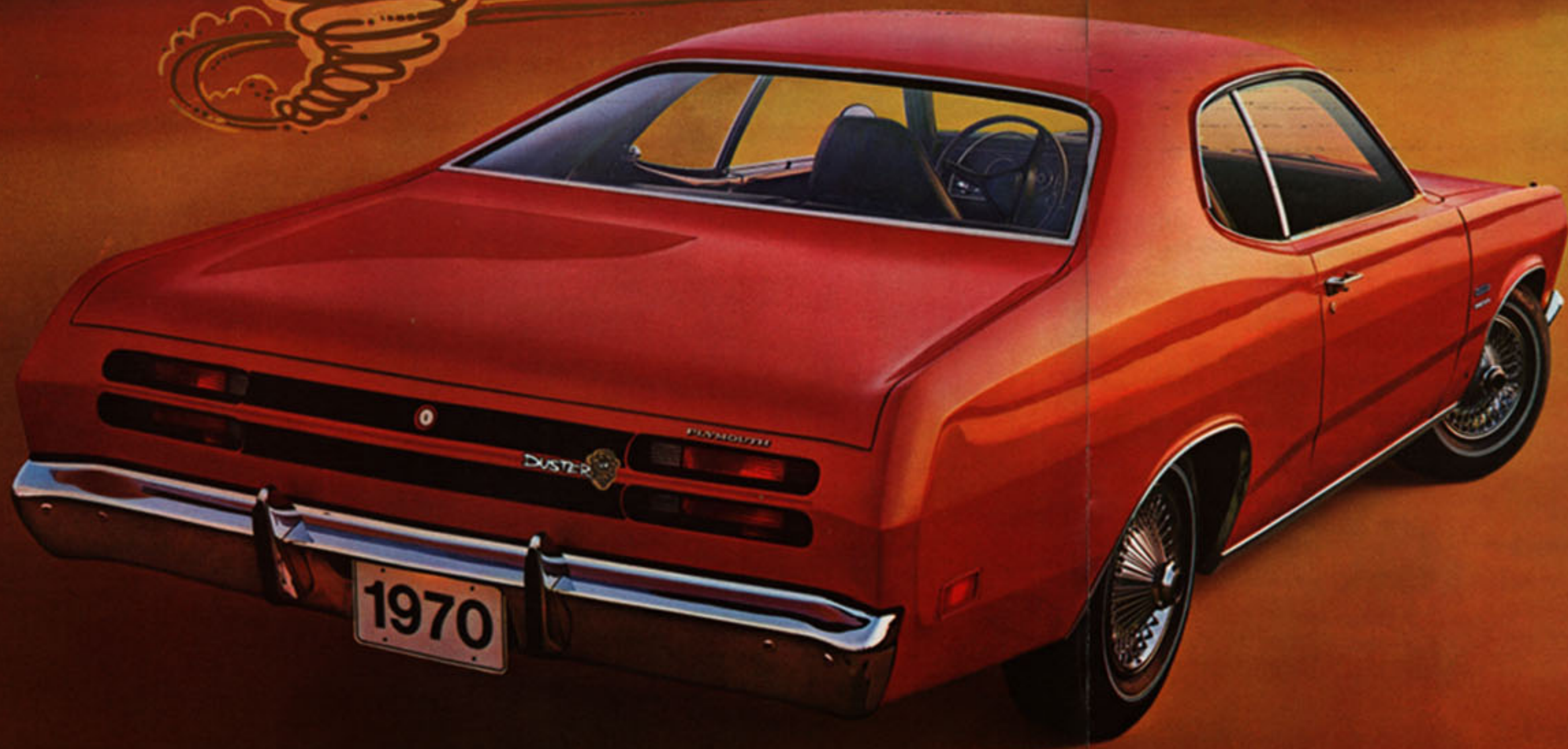
Valiant Duster Coupe