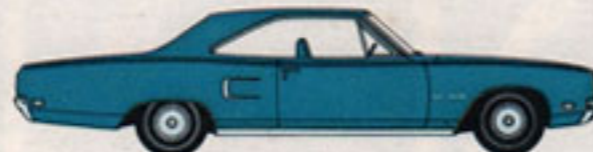
Sport Satellite 12-door hardtop and 4-door sedan—V-8