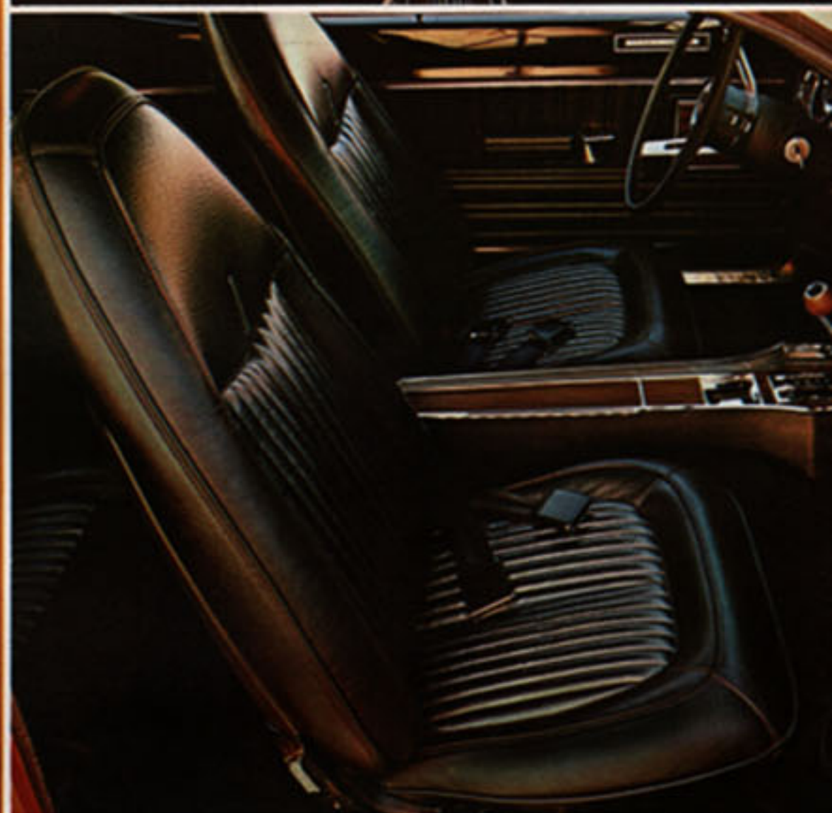
Valiant Duster 340 Coupe