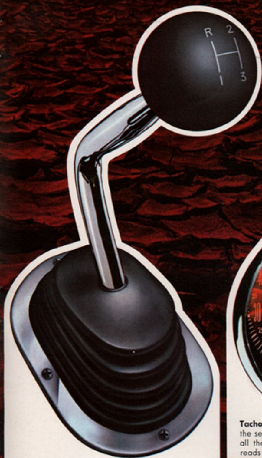
Three-on-the-floor makes it. New for '70: A three-speed fully synchronized manual transmission. Standard on the column with the 318 V-8. Optional on the floor with any Duster engine. (Standard on Duster 340.)