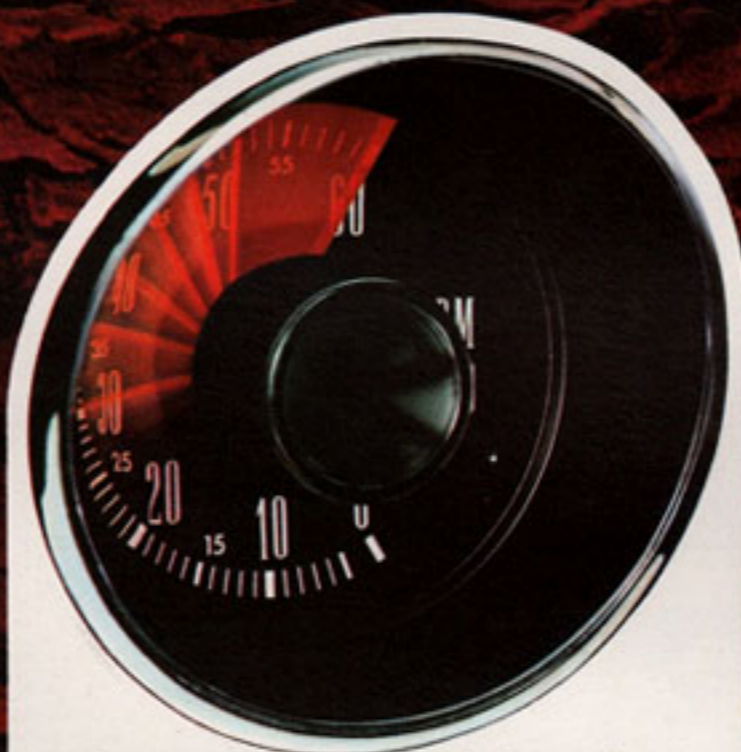
Tachometers make it. Seen in the best circles. For the serious driver who likes to know what's going on all the time. The dial reads from 0-6000 rpm. And reads fast.