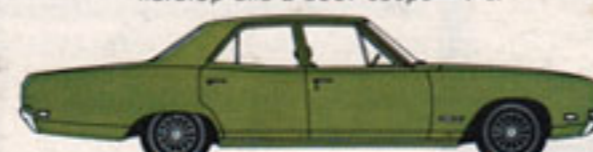
Belvedere 12-door coupe and 4-door sedan—V-8 or Six