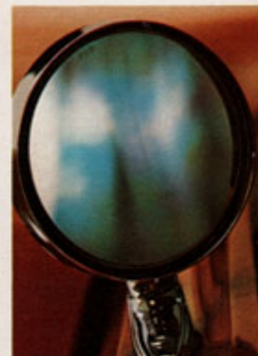
In this case, hindsight makes it. Our outside rearview mirror. Controlled from inside the car. No rolling down the window in the rain to adjust it. The mirror is recessed for protection against the elements.