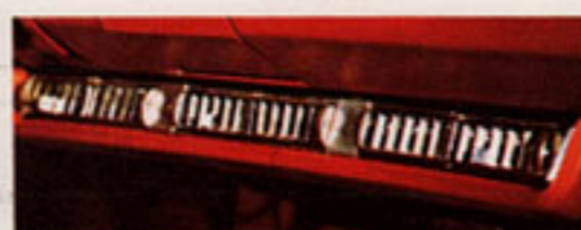
Air certainly makes it. Chrysler Airtemp air conditioning. Go dust-free, pollen-free and unruffled by hot weather. (Not available with 198 cu. in. Six.)