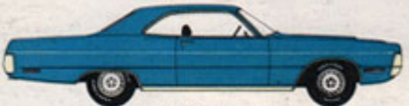
Sport Fury GT 12-door hardtop—V-8 S/23 12-door hardtop—V-8