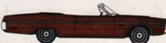
Fury III (convertible, 2-door formal hardtop and 4-door hardtop—V-8; 4-door sedan and 2-door hardtop—V-8 or Six)