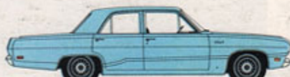
Valiant 4-door sedan—V-8 or Six