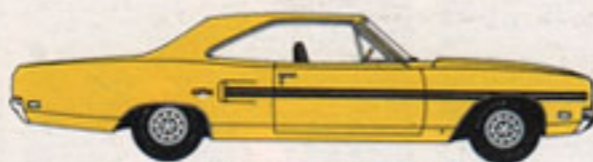
GTX 12-door hardtop—V-8