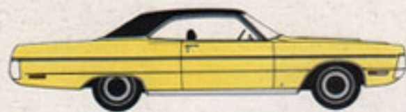
Sport Fury 14-door sedan and hardtop, 2-door hardtop and formal hardtop—V-8