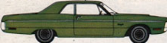
Fury II 12- and 4-door sedans—V-8 or Six