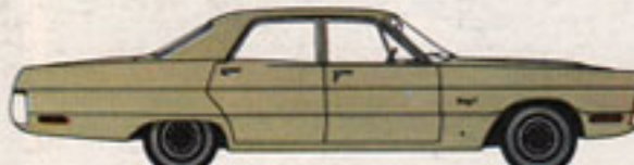
Fury I 12- and 4-door sedans—V-8 or Six