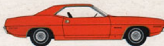
Gran Coupe (convertible and 2-door hardtop—V-8 or Six) Barracuda (convertible and 2-door hardtop—V-8 or Six)