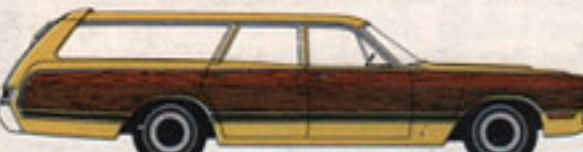
Fury Wagons (Sport Suburban 2- and 3-seat models—V-8) (Custom Suburban 2- and 3-seat models—V-8) (Suburban 2-seat model—V-8 or Six 3-seat model—V-8)