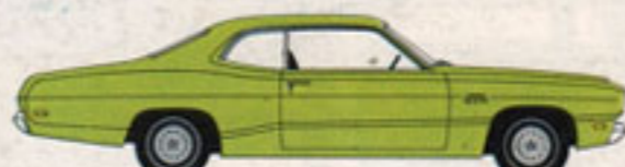
Duster 12-door coupe—V-8 or Six Duster 340 12-door coupe—V-8