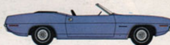
Cuda (convertible and 2-door hardtop—V-8)