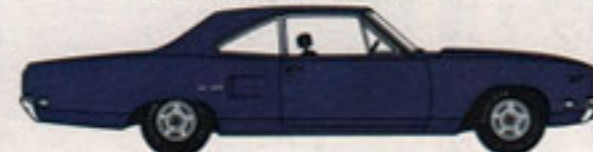
Road Runner (convertible, 2-door hardtop and 2-door coupe—V-8)