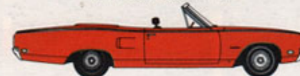
Satellite (convertible, 2-door hardtop and 4-door sedan—V-8 or Six)