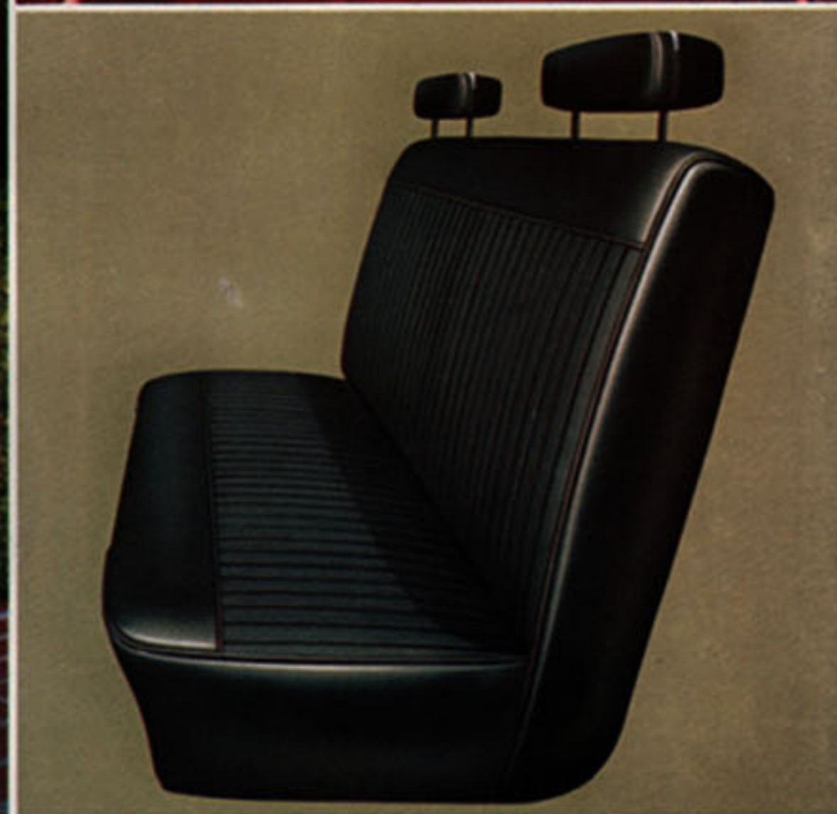
Valiant 4-Door Sedan