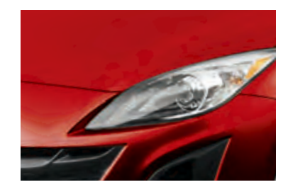
Velocity Red Mica