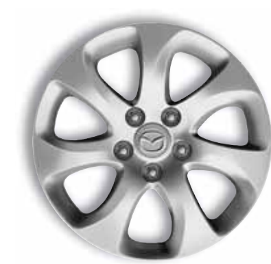
16" Steel Wheel Cover