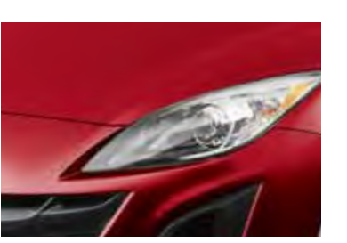
Copper Red Mica