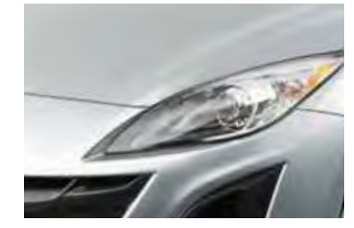
Liquid Silver Metallic