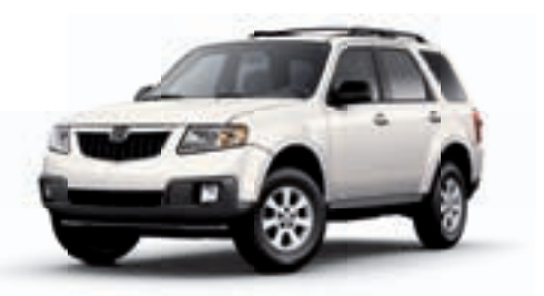
WHITE SUEDE TRIM LEV Tribute Sport, Touring Tribute Grand Touring

FABRICS INTERIOR Graystone Cloth Leather Gravstone