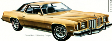
Grand Prix LJ Hardtop Coupe

This literature is applicable only to 1975 General Motors vehicles equipped with a Catalytic Converter.