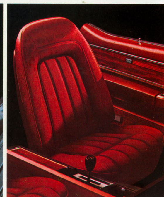
Cover: Grand Prix SJ Hardtop Coupe; Page 2: Grand Prix Hardtop Coupe; Above: Optional 60/40 full-width seat; Left: Grand Prix LJ interior; Far left: Grand Prix standard interior.

Some of the equipment shown or mentioned is optional at extra cost.