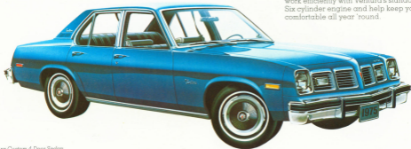
Ventura Custom 4-Door Sedan

Consider air conditioning. A new, simplified air conditioning system can work efficiently with Ventura's standard Six cylinder engine and help keep you comfortable all year 'round.