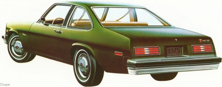
Ventura 2-Door Coupe

A test-drive will show you what this newness means on the road.