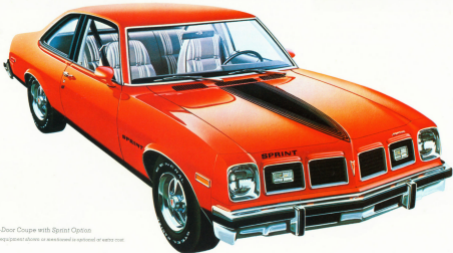
Ventura 2-Door Coupe with Sprint Option

Some of the equipment shown or mentioned is optional or extra cost.