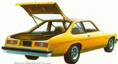
Ventura Hatchback Coupe

It goes on. Ventura's equipped with radial tires, front disc brakes and a double-panel roof. You've a choice of