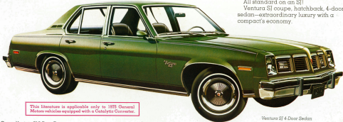
Ventura SJ 4-Door Sedan

Ventura SJ coupe, hatchback, 4-door sedan—extraordinary luxury with a compact's economy.