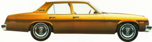
Ventura 4-Door Sedan

There's a lot to enjoy if your new compact is a Ventura from Pontiac.