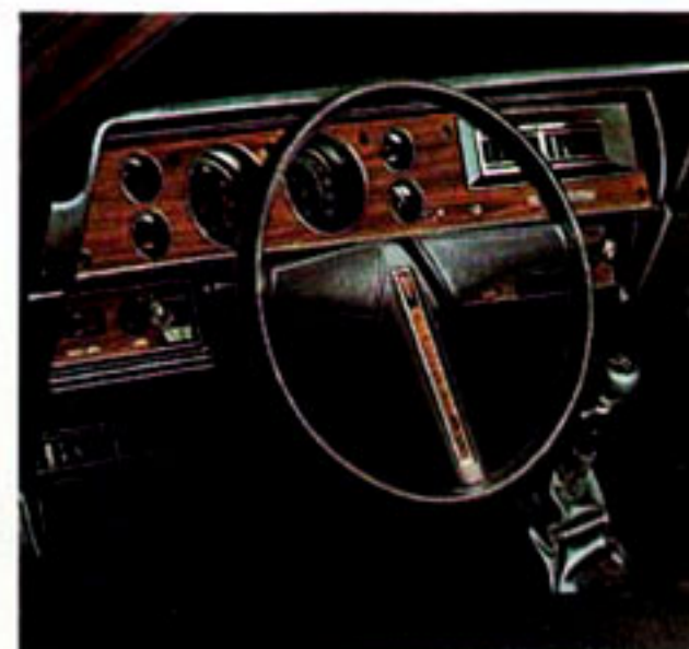
IP on GT. And that spells sporty. It comes with a rally gauge cluster including clock and tach.