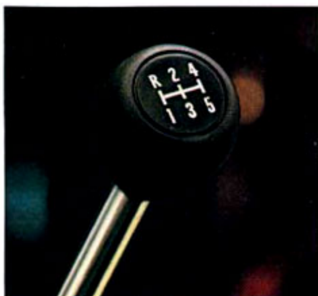
You want to mix it up? Order Astre's new 5-speed transmission. 5th acts as an overdrive. Reduces engine rpm at highway speeds.