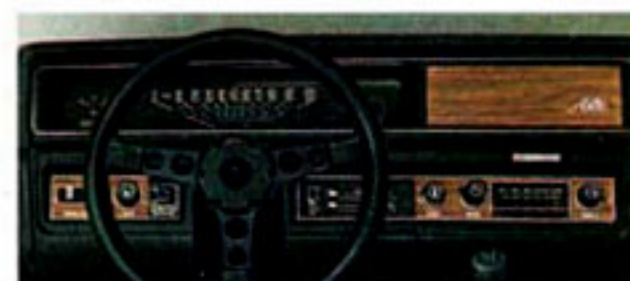
You can add a little sportiness to the standard Astre IP by ordering a Formula steering wheel.