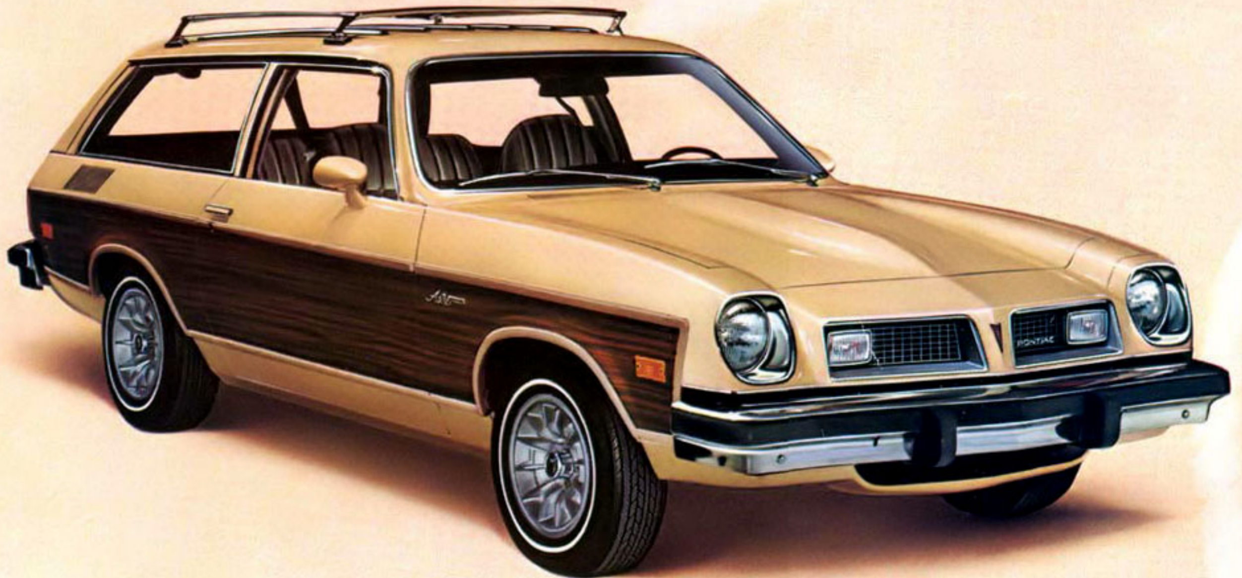
Astre 2-Door, 2-Seat Safari Wagon.

The custom interior gives you an even nicer cloth or all-Morrokode upholstery for the Hatchback Coupe or Safari Wagon. It also includes pull straps and map pockets for the doors, a rear seat ash tray, an assist strap on the instrument panel among other good things.