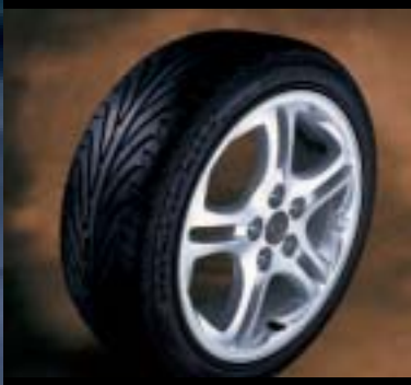
The GT V6 has standard 17-inch aluminum alloy wheels¹ with 215/45 Michelin® tires that provide quick handling.