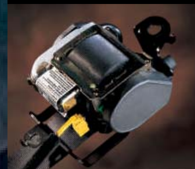
The 3-point front seatbelt pretensioners lock in the event of a moderate to severe frontal impact.