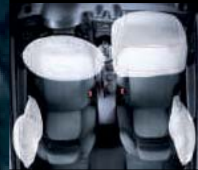
Dual front airbags<sup>2</sup> and front side airbags, both standard, protect the driver and front passenger.