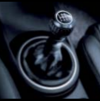
Optional on Tiburon GT V6 is a quickshifting, 6-speed manual transmission.