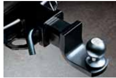
A CONVENIENT TOW HITCH IS READY TO HAUL YOUR TOYS TO YOUR FAVORITE DESTINATIONS.