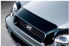
A DEALER-INSTALLED HOOD DEFLECTOR PROTECTS THE FINISH AGAINST DIRT, DEBRIS AND CHIPS.