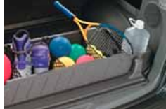
A FOLDING CARGO ORGANIZER CONVENIENTLY KEEPS YOUR STORAGE SPACE TIDY.

If you'd like to customize your Santa Fe, please see your Hyundai dealer for the full line of Hyundai accessories. You should always use genuine Hyundai parts and accessories, which meet strict standards for quality and durability.