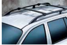
ROOF CROSS RAILS THAT ACCOMMODATE SKI, SNOWBOARD AND BIKE CARRIERS.