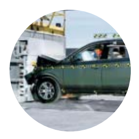
YOU CAN NEVER BE TOO SAFE

Our vehicles' excellent safety ratings are the result of thousands of hours of simulations in state-of-the-art safety testing facilities. Is destroying millions of dollars worth of automobiles worth it? Absolutely.